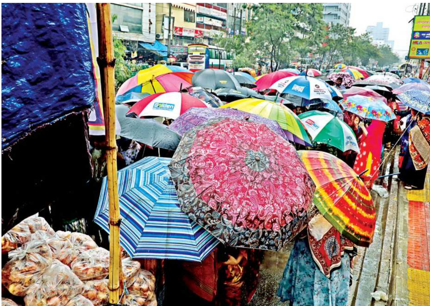
Braving incessant rain, people crowd around a TCB truck to buy daily essentials in the capital's Rampura yesterday afternoon.