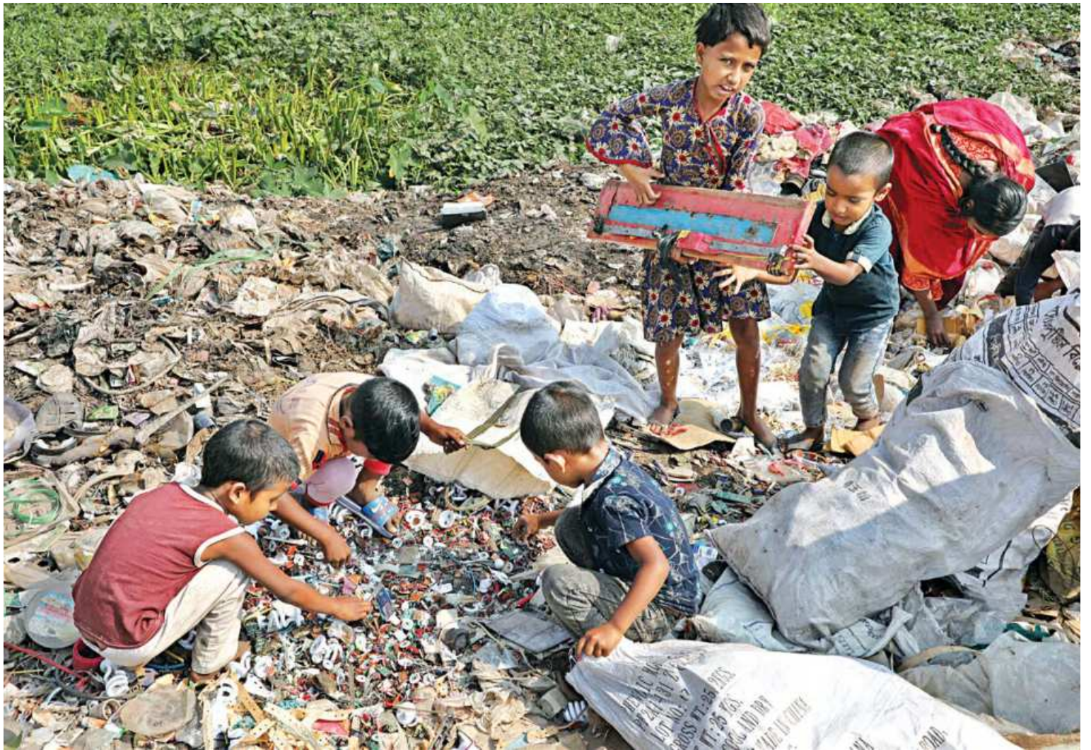
Children collecting iron and other metal scraps from the rubbish dumped on the side of the road to sell them later. The photo was taken at Savar's Phulbaria on the Dhaka Aricha Highway yesterday.