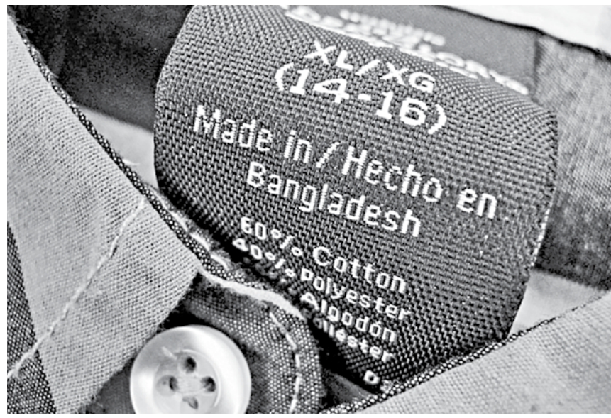
Ensuring transparency all throughout the supply chain can help boost the image of the brand that is 'Made in Bangladesh.'

Taking one recent example from another country: a traceable textile specialist has just announced a partnership with an industrial park developer in Africa to supply fully traceable cotton from Benin. This new pilot programme will enable spinner-to-garment traceability on products,