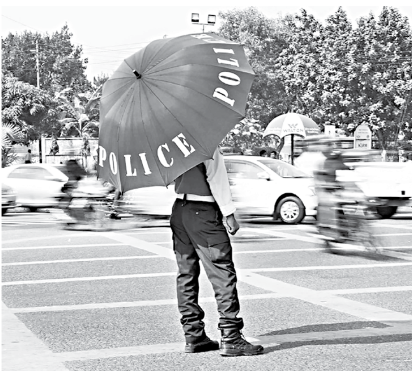
Working long shifts is common for police constables, as is working during holidays and festivals, and often under tremendous stress.

Muhammad Nurul Huda is a former IGP of Bangladesh Police.