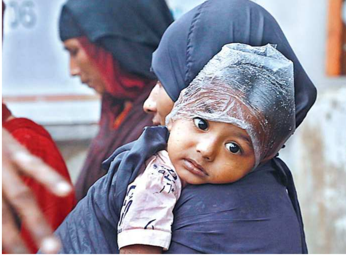
The sudden rainfall has startled all residents of the capital, as they tried their best to take shelter from the raindrops above yesterday. In TSC area, this little one's parent put a plastic bag over the child's head to create some sort of safeguard. Top right, At Karwan Bazar, produce sellers were basically trapped inside their stalls, as water inundated their surroundings. Meanwhile, students were seen holding on to their umbrellas, as they gathered in droves in front of a school at Mohammadpur.

According to DGHS, 98 people have died of dengue infection in the country this year.