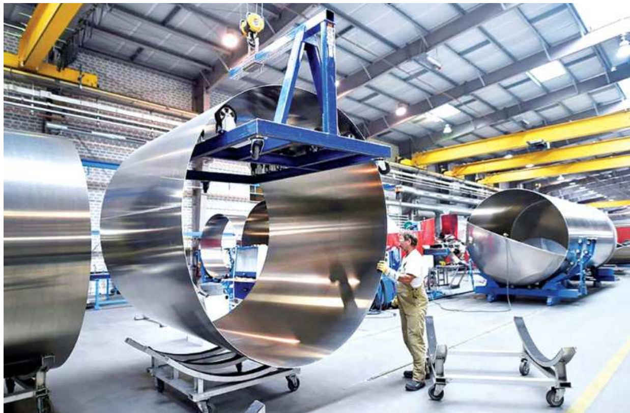
A worker at German manufacturer of silos and liquid tankers, Feldbinder Special Vehicles, moves rolls of aluminium at the company's plant in Winsen.