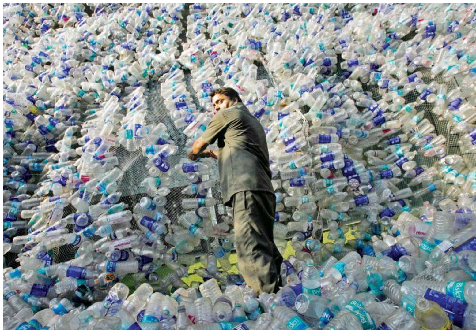
An employee of Mumbai Educational Trust, which runs educational institutes, adjusts plastic bottles in an installation made of approximately 40,000 plastic bottles to protest the use of plastic in Mumbai.