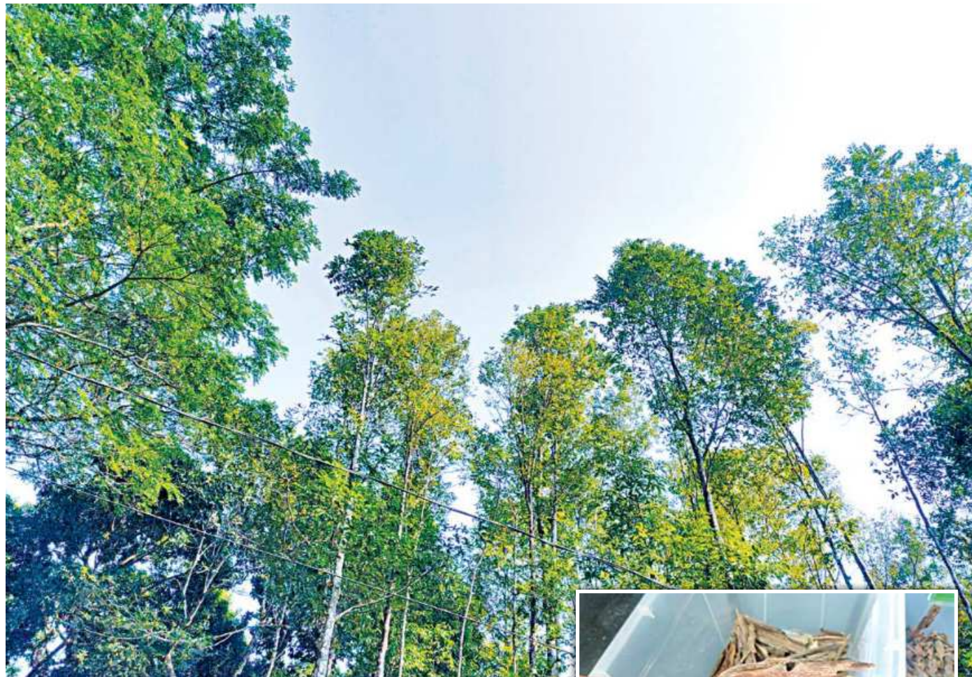
A cluster of agarwood trees in Sujanagar union of Moulvibazar district. (Inset) Parts of the wood containing an aromatic resin is collected from these trees to make various scented products, such as perfumes and creams, that are exported mainly to countries in the Middle East. The photos were taken recently.

Rubel Ahmed Pavel of Uttar Sujanagar village has been cultivating the trees and processing agarwood for a couple of decades.