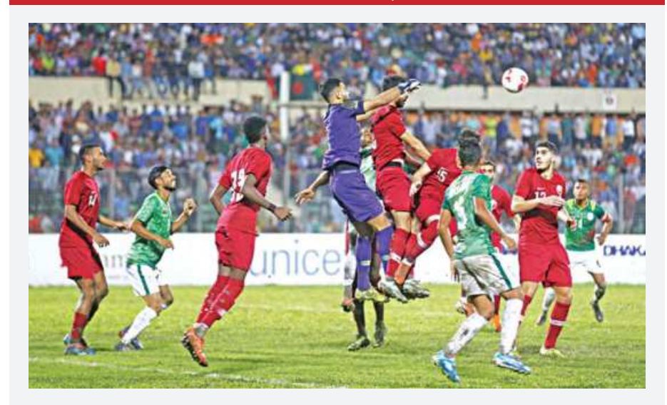
Match ended 2-0 in favour of visiting Qatar > Hosts showed spirit and fight on rain-soaked ground

surprising result > Bangladesh made two defensive lines to thwart the Asian champions