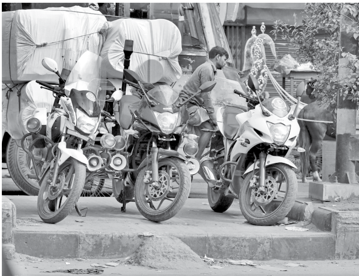
Three police motorbikes parked side by side on a footpath in front of Golap Shah's shrine at the capital's Gulistan yesterday, blocking the way for pedestrians. When law enforcers themselves flout rules, regular citizens find it increasingly normal to disregard law and order.

"A four-lane road from Begumganj to Laxmipur will be upgraded soon," he added.