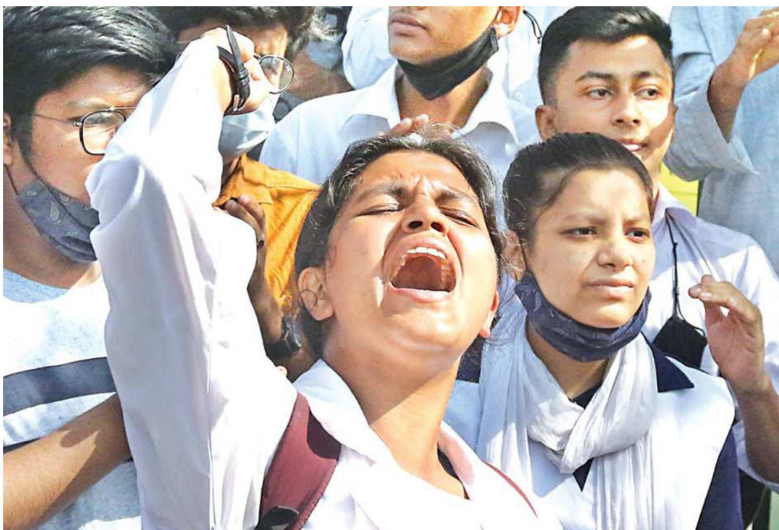
A student chants slogans during a demonstration in the capital's Rampura bridge area yesterday demanding the government meet their 11-point demand, ensuring road safety. Students, who took to the streets a few days ago, said they will continue their protests until their demands are met.