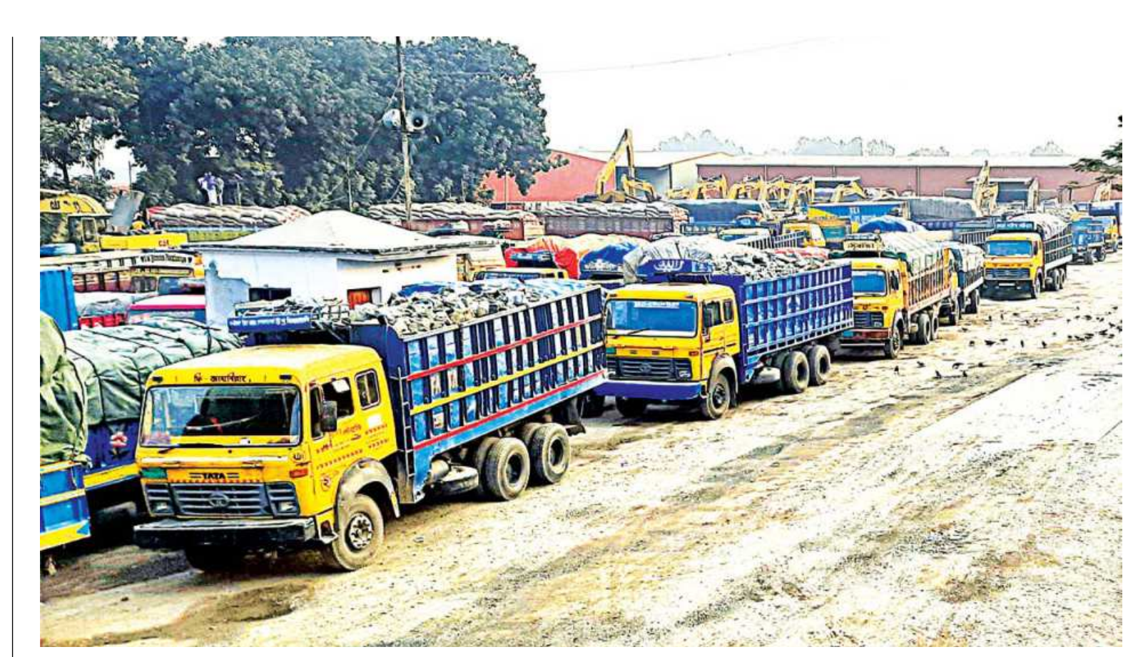
Local trucks are seen carrying off stone imported from India through the Hili land port in Hakimpur upazila of Dinajpur. Despite being a major land port for both the countries, traders are increasingly turning to alternatives with better facilities. The photo was taken recently.