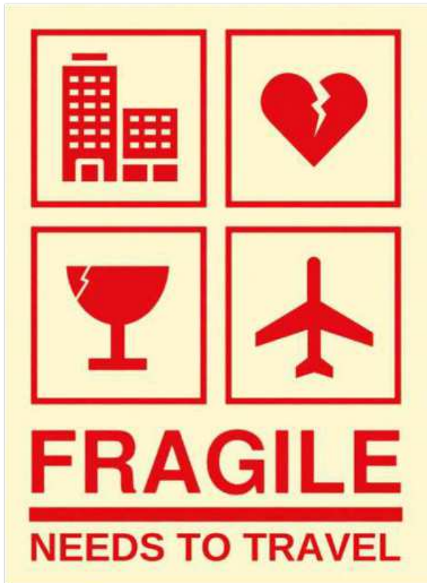
DESIGN: KAZI AKIB BIN ASAD