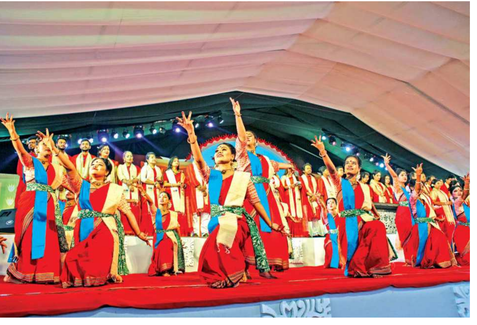
A troupe of dancers perform during the inaugural ceremony of Dhaka University's 16-day programme marking the centenary celebrations of its founding at DU campus in the capital yesterday.

"A team of well-trained physicians and advanced SEE PAGE 2 COL 3