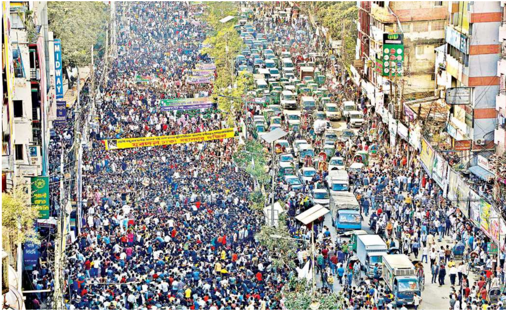
Thousands of people demonstrating in front of BNP headquarters in the capital's Nayapaltan area. They demanded the release and proper treatment of the party chairperson Khaleda Zia. The photo was taken around 2:30pm yesterday.