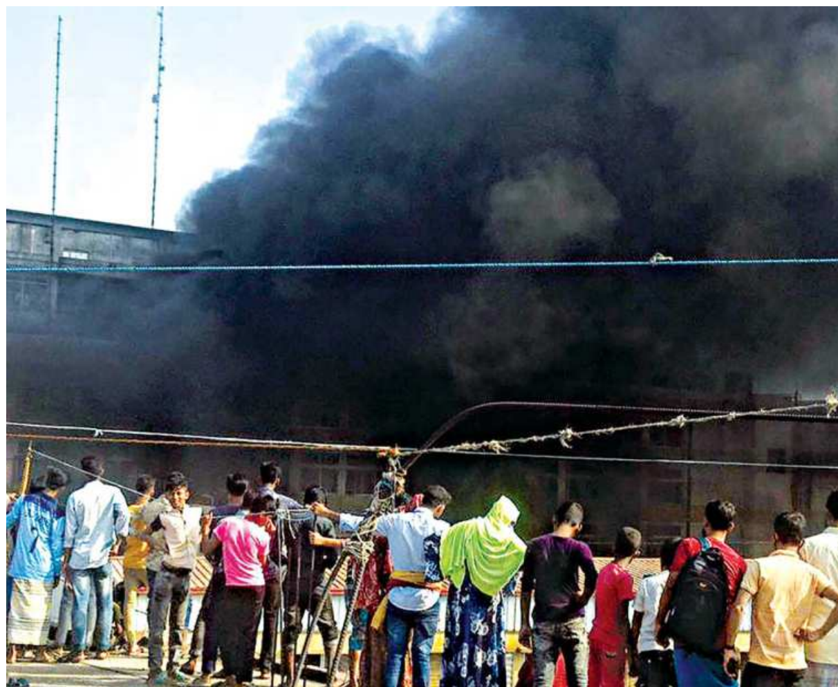
Black smoke forms a cloud above a readymade garment factory that caught fire in Gazipur city's Konabari area. At least 3,000 workers were employed there. The photo was taken yesterday.