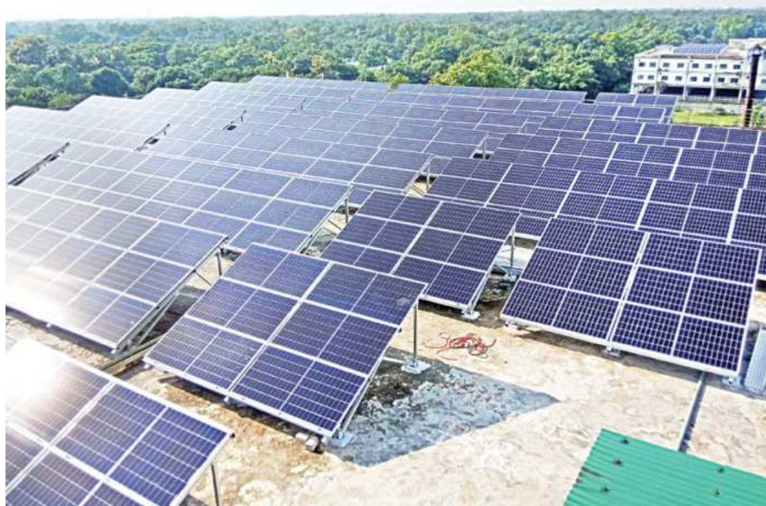
Industrial rooftop solar power projects could be a significant contributor to the country's energy grid as it is cheaper and cleaner to produce electricity from renewable sources such as this compared to traditional methods.