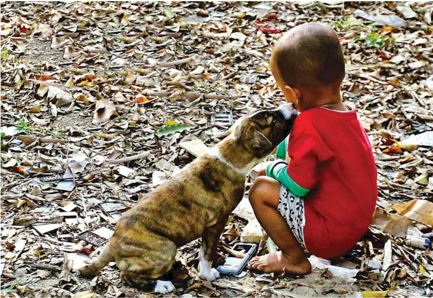
NO ORDINARY LOVE .... A toddler getting kisses from his trusty four-legged companion while the two were playing near Mohanagar Natya Mancha in the capital's Gulistan area yesterday. In a city, where street dogs are often mistreated by humans, watching children grow up in such companionship and unconditional love comes as a breath of fresh air.