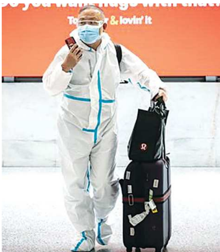
A traveller in PPE arrives at the Sydney airport as countries brace themselves for the new Omicron variant of the coronavirus.