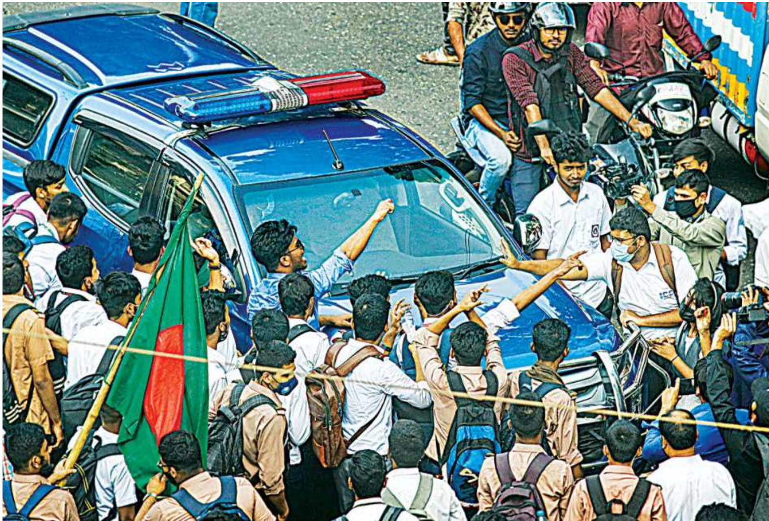
Students demanding safer roads stop a vehicle of Armed Police Battalion in the capital's Dhanmondi-27 area as the vehicle had no number plates. Since a Notre Dame College student was run over and killed by a garbage truck on Wednesday, they have been demonstrating on the streets and checking vehicles' documents and drivers' licences.