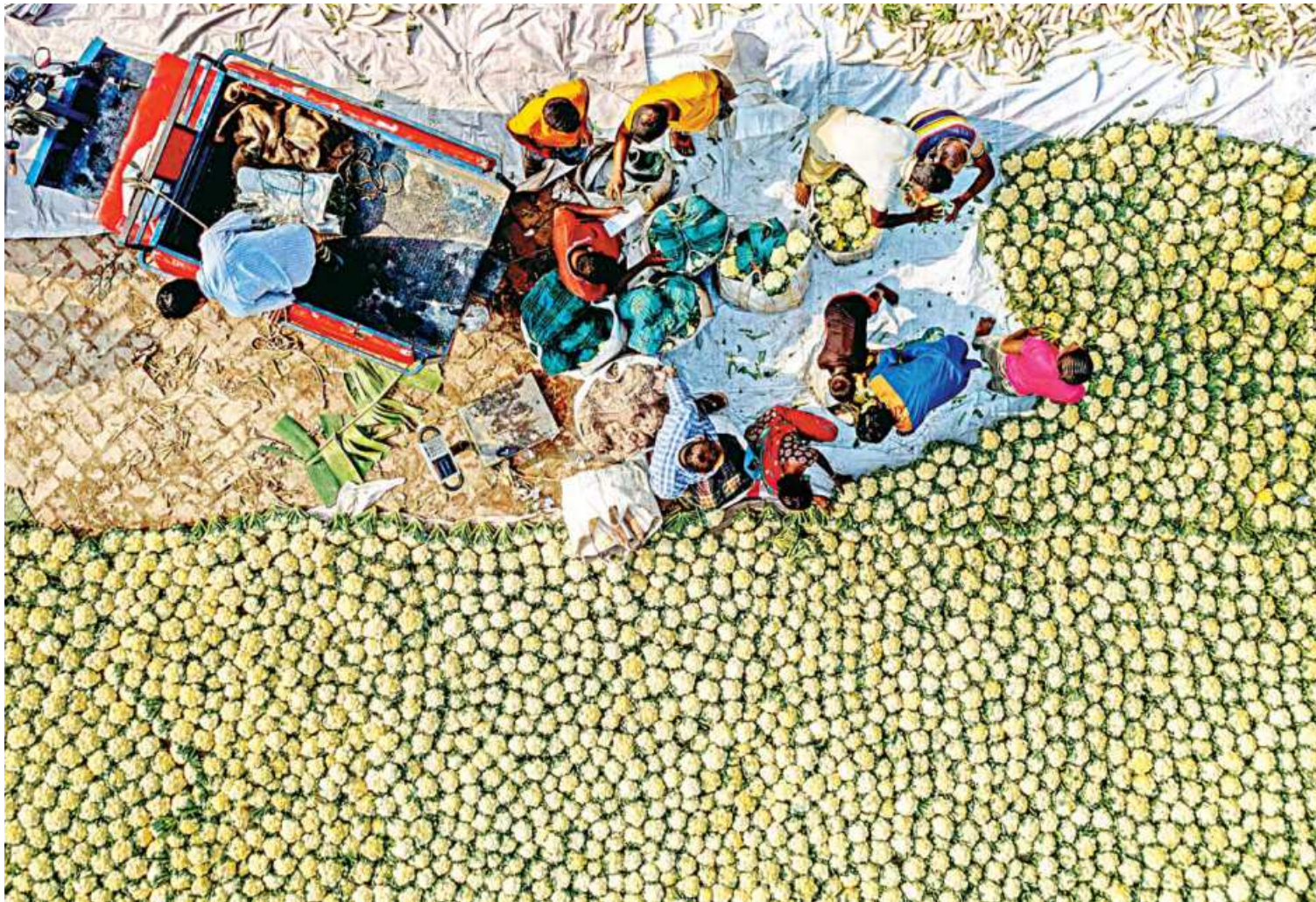
Traders gather winter vegetables like cauliflower and radishes at a market in Mohasthanagarh of Bugura's Shibganj upazila yesterday. Winter vegetables are flooding the markets across the country as farmers, who had planted early, are harvesting their crops now.