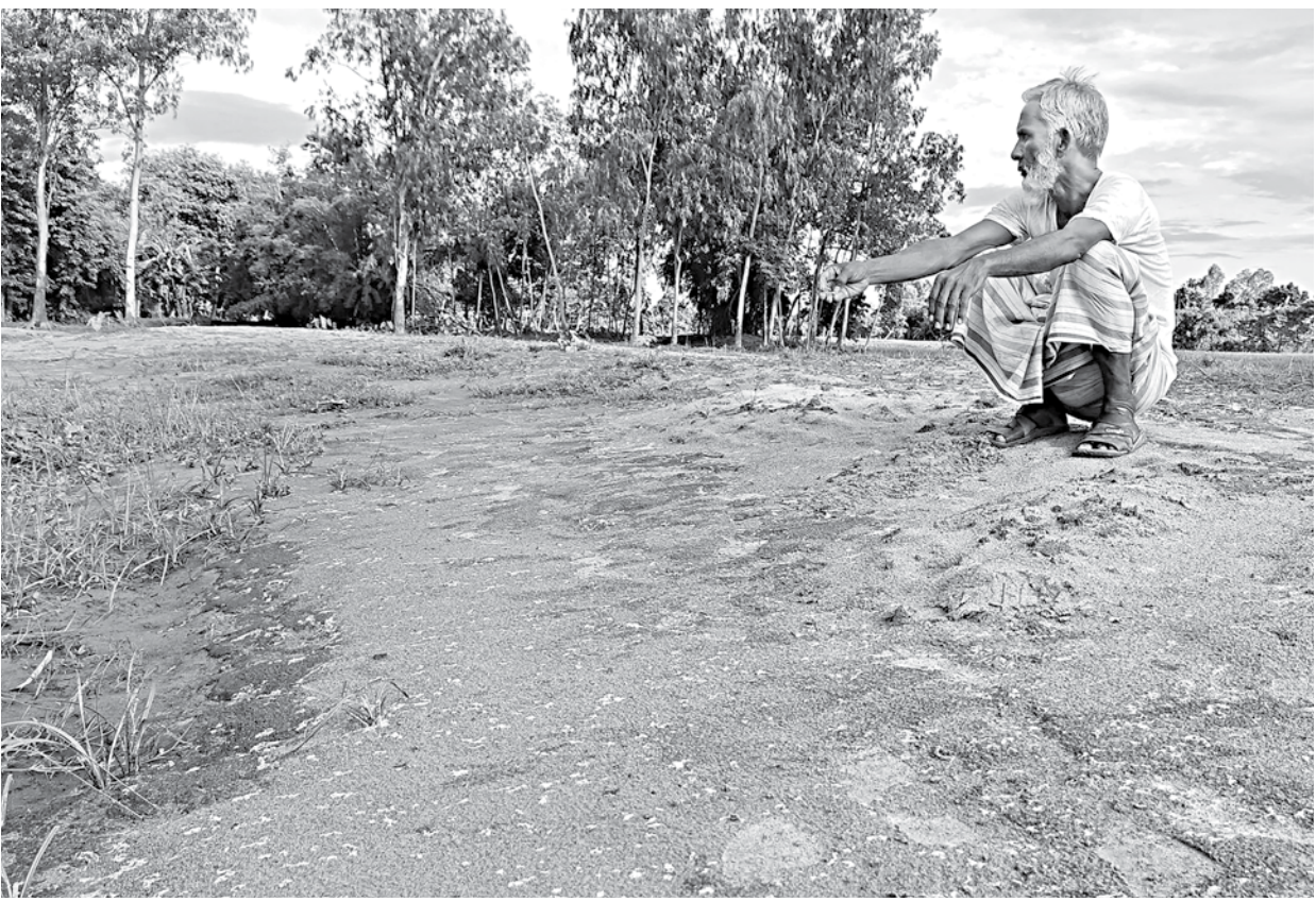
This year's prolonged flood has covered vast farmlands with sand, worrying farmers. The photo was taken from Sardob village in Kurigram Sadar upazila recently.