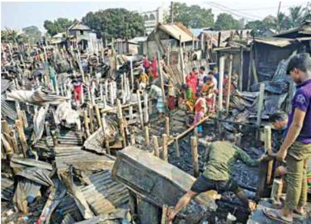
Fire tore through the Mazar slum adjacent to Sena Kalyan Bhaban in Tongi in the early hours of yesterday. About 500 shanties were gutted. As dawn broke, many of the slum dwellers were seen trying to salvage whatever they could from the rubble. Primary investigation suggests that the fire originated from a mosquito-repelling coil. The photo was taken yesterday noon.