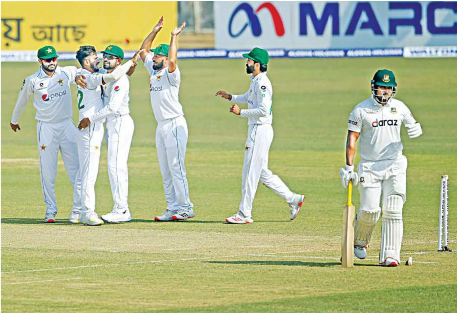
Pakistan pacer Hasan Ali took four wickets inside the opening session as Bangladesh were bundled out for 330 on the second day of the first Test between Bangladesh and Pakistan at the Zahur Ahmed Chowdhury Stadium in Chattogram yesterday. In reply, Pakistan reached 145 without loss.