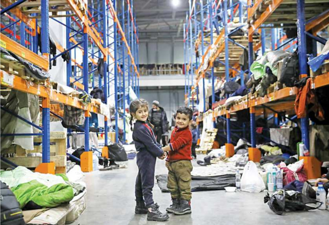
Migrant children pose for a photo at the transport and logistics centre Bruzgi on the Belarusian-Polish border, in the Grodno region, Belarus yesterday. Belarusian leader Alexander Lukashenko told migrants stranded at the border with Poland that his country would help them to return home if they wanted but would not force them.