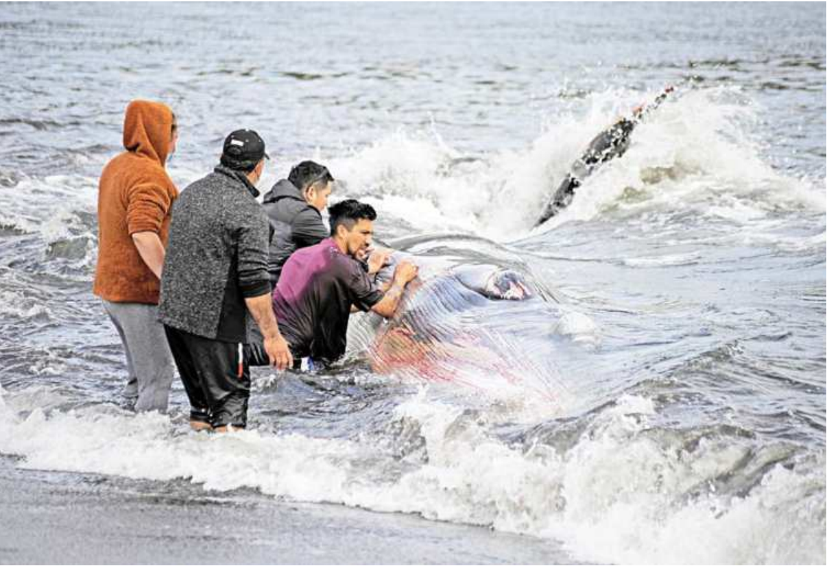
People try to return a whale to the sea after it beached itself at the shores of the fisherman's cove Lenga, near Hualpen, Chile on Friday.