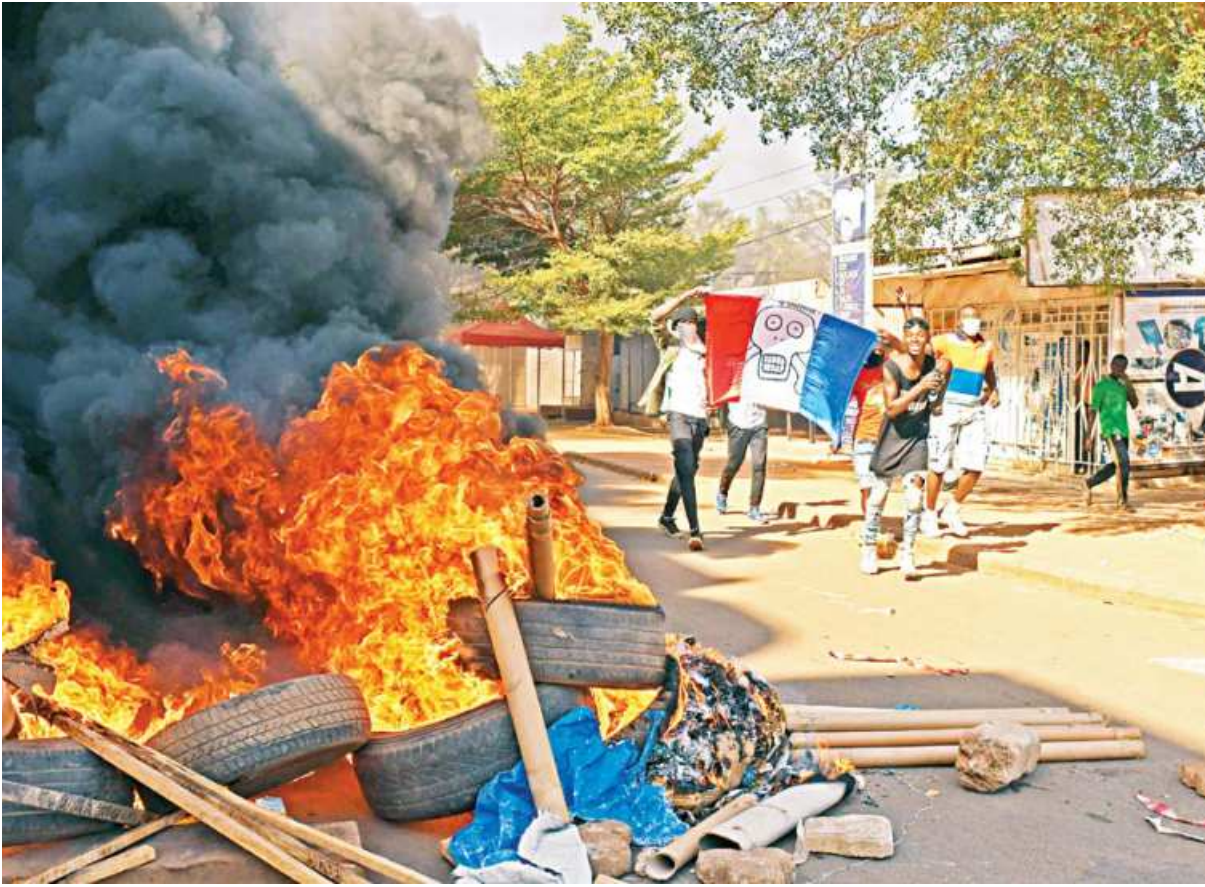
Civil organisations hold a protest calling for Burkina Faso's President Roch Kabore to resign and for departure of French forces that patrol the country, in Ouagadougou, Burkina Faso yesterday.

"The security environment surrounding Japan has been rapidly changing at an unprecedented speed. Things that used to happen only in science-fiction novels are today's reality," Kishida said. He said his government will lead "calm and realistic" discussions to determine what is needed to protect people's lives and gain their understanding. The possibility of possessing so-called enemy base strike capability has been a divisive issue because opponents say it violates Japan's war-renouncing constitution. Kishida has shifted his dovish stance to a more hawkish one, apparently to please influential leaders within his governing party, including former Prime Minister Shinzo Abe, and to strengthen his grip on power. He now advocates increasing Japanese military capability and spending. On Friday, Kishida's Cabinet approved a 770 billion Japanese yen ($6.8bn) request for an extra defence budget through March to expedite the purchase of missiles, anti-submarine rockets and other weapons amid rising concern over the escalation of military activities by China, Russia and North Korea.