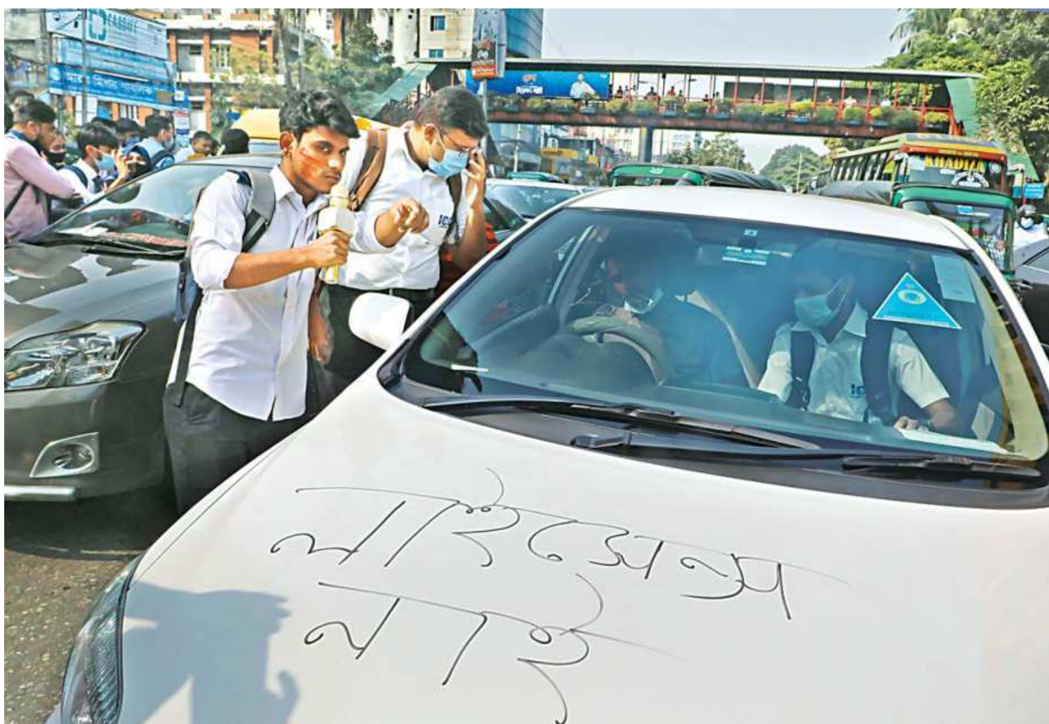
School and college students on Dhanmondi-27 write "no licence" on the bonnet of a car after finding the driver without a valid licence yesterday. Students demonstrating for safer roads have been stopping vehicles to check the registration and licence for the last few days.