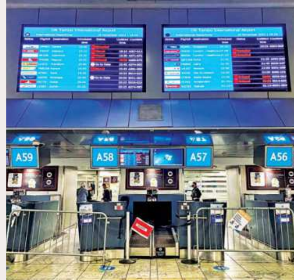
Digital display boards show cancelled flights at OR Tambo International Airport in Johannesburg on Friday.