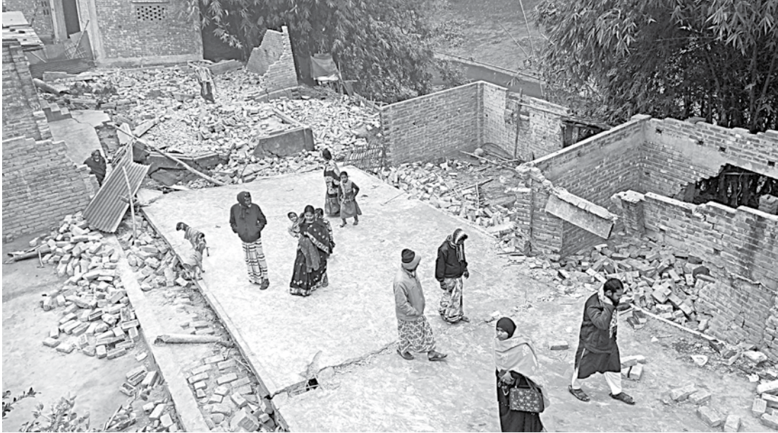
Locals have a look at a roof of a building that collapsed at Johorpur village in Shibganj upazila of Chapainawabganj. The building along with 24 other structures in the village, situated by a canal, started to develop cracks on November 10 as the ground started subsiding. All the 25 structures crumbled within the next few days, turning the impoverished residents homeless overnight. Shibganj Upazila Nirbahi Officer Shakib Al Rabbi said they provided food relief and blankets to the victims and were considering rehabilitating eight fisher families that lost their homes. Upazila Project Implementation Officer Ariful Islam said they sought expert assistance to ascertain the cause of the subsidence.

People can easily run their business without any hassle at Pattashi Bazar as it is toll free and there is no extra charge for buying or selling, said Zahangir Sheikh, general secretary of the bazar management committee.