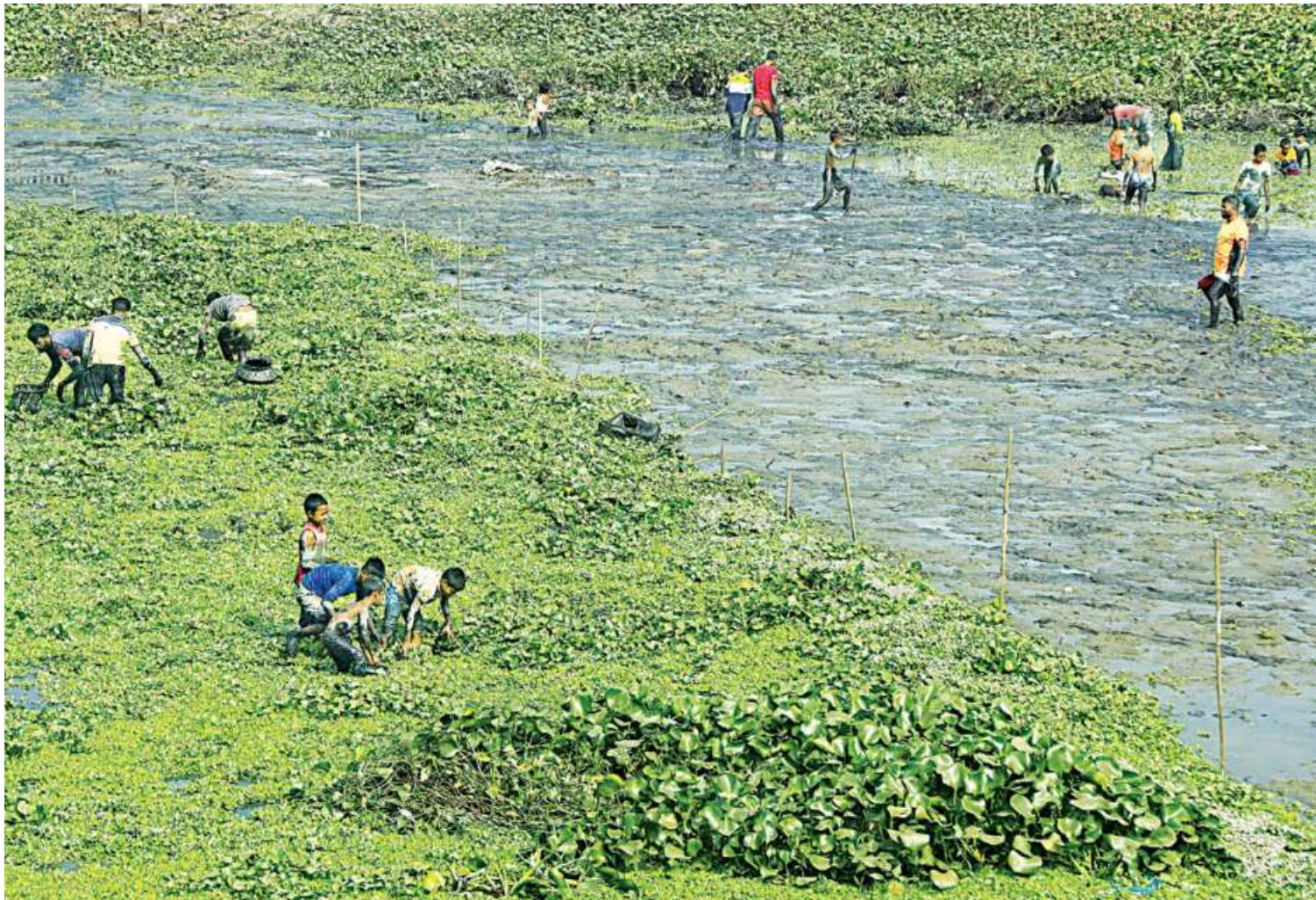
Mostly children and teens have a day of fun catching fish with their bare hands in a canal in Baliarpur of Savar yesterday. With the onset of winter, rivers, canals, lakes and ponds have started drying up across the country and festive scenes like this have become common.