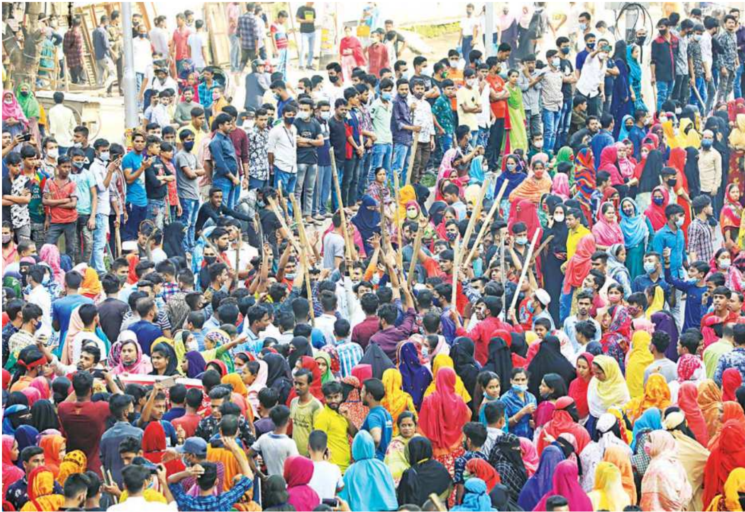
Garment workers demonstrate in Mirpur-13 yesterday demanding salary hike among others. They torched two motorbikes and vandalised an Awami League office for what they said was beating up of fellow workers.

Although the police station was nearby, policemen reached the spot after the protesters ended their vandalism, SEE PAGE 5 COL 4