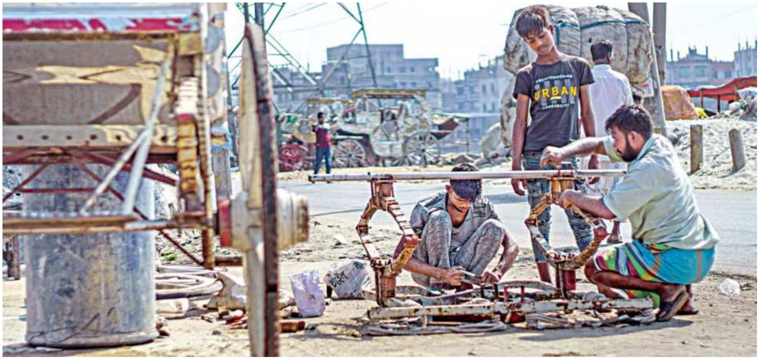
Riding on horse-carts is still popular in Old Dhaka. But plying the area's bumpy roads can take a toll not only on the animals, but also on the vehicles. This means they require regular repairs, and yesterday, some mechanics were busy fixing shock absorbers of carts at Kamrangirchar.