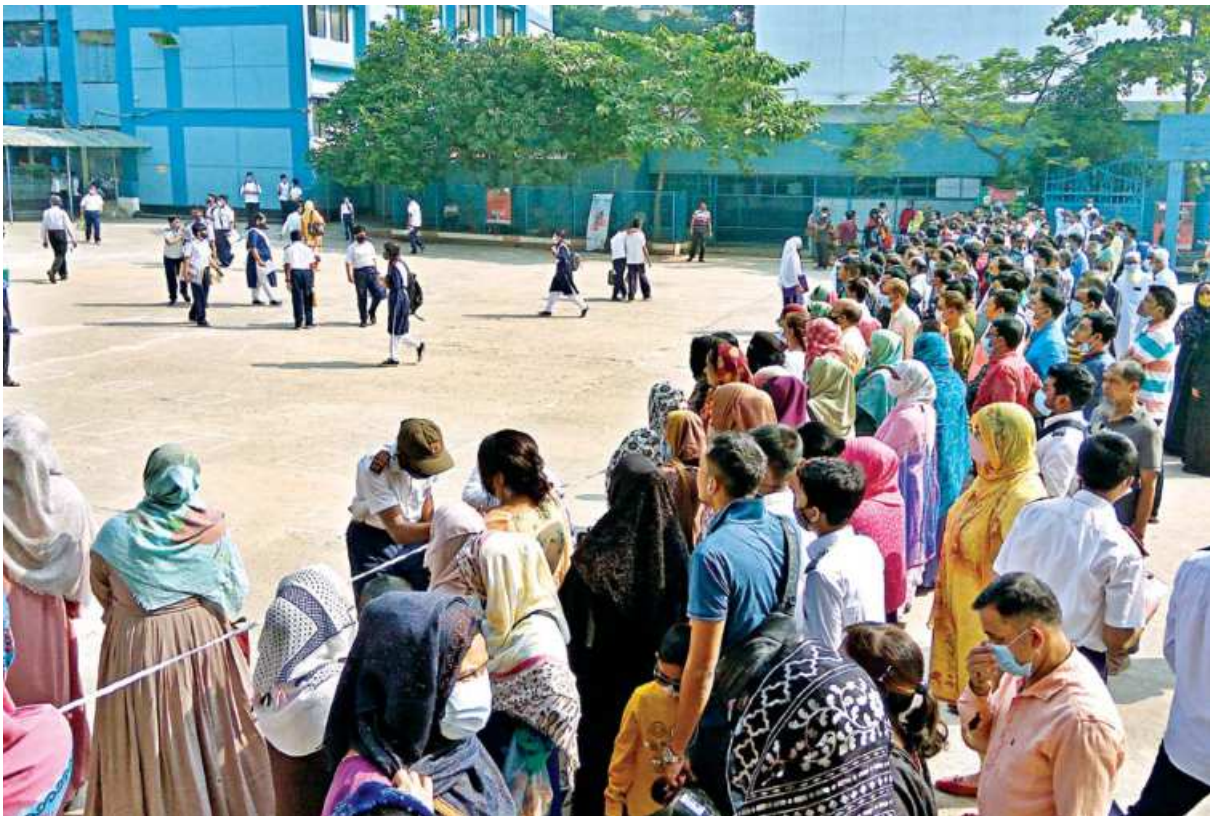
After almost two years, the stress, anxiety, as well as excitement centring final examinations have returned to schools. Yesterday morning, the capital's Willes Little Flower School was buzzing as guardians accompanied students for their tests.

CTTC arrests man for replicating e-commerce sites to swindle people