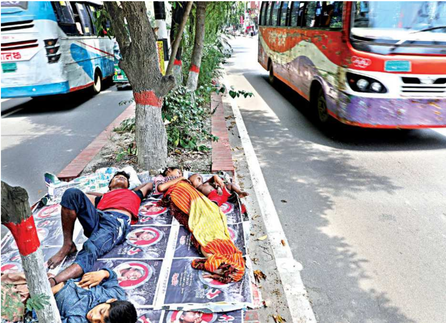
Sleeping on the dividers of a busy street is risky as it is, but when there's a toddler asleep right on its edge, the danger increases manifold. At any point, the child might move and fall onto the road, while vehicles of all kinds pass by at speed. This photo was taken recently from the capital's Dhanmondi Road-2 area.