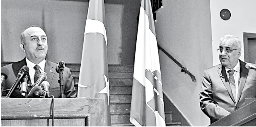
Turkish Foreign Minister Mevlut Cavusoglu, left, and his Lebanese counterpart Abdallah Bou Habib hold a joint press conference in Beirut, Lebanon, on November 16, 2021.

Despite improving relations between Turkey, the UAE, and Saudi Arabia, it was unlikely that the Gulf states would loosen their stranglehold on Lebanon or that they would trust Turkey to be an