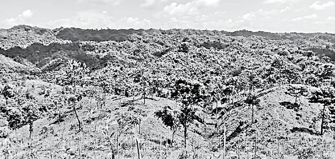
There needs to be a balance between development work and conservation of nature; the two ideas cannot be at odds in this day and age.