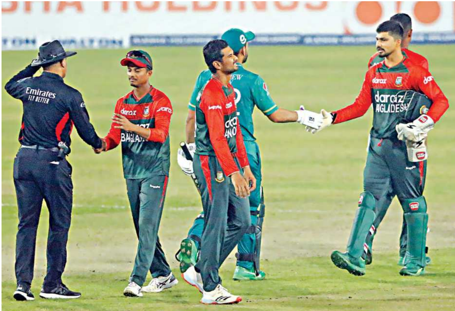
Mahmudullah Riyad (C) could not hide his frustration as Pakistan eked out a five-wicket victory and a clean sweep of the three-match series despite a three-wicket haul from the Bangladesh skipper in the final over of the third T20I at the Sher-e-Bangla National Stadium in Mirpur yesterday.