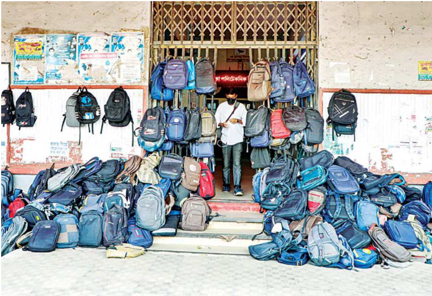
NORMALCY RETURNS...Schoolbags hanging outside the exam centre at the Dhaka Polytechnic Institute, as examinees are not allowed to carry bags or any other material, except for stationery, inside. With the situation finally coming back to normal, educational institutions have started taking their session exams, which were postponed due to the pandemic. The photo was taken yesterday.