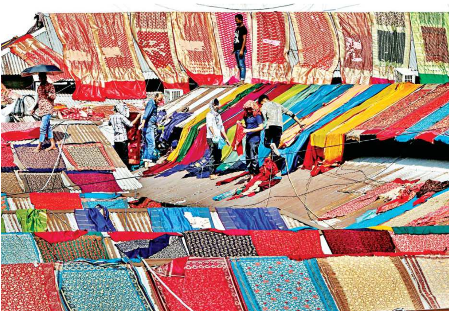
The roof of Banga Bazar market in the capital turns colourful as Indian saris and other clothes kept there for drying in the sun. Traders import the clothes from India and then wash and "polish" before putting them up for sale in the market.