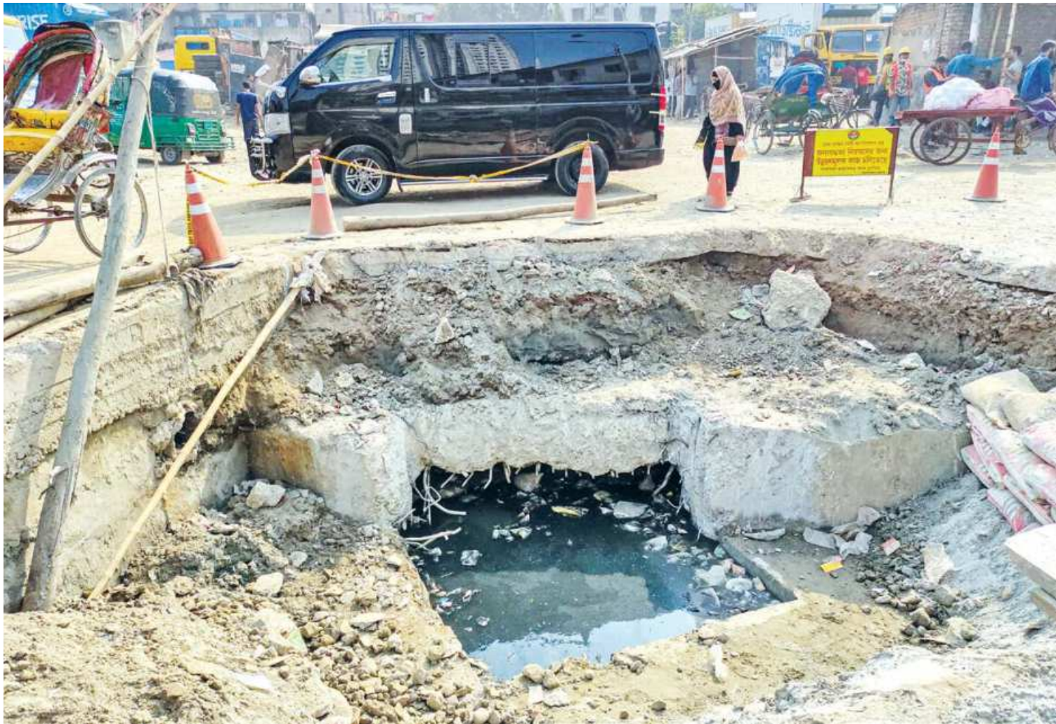
Some cones are all there is to warn pedestrians and motorists of the gaping hole in a street in the capital's Kamalapur. Locals claimed that the drain has been left like this for many days.