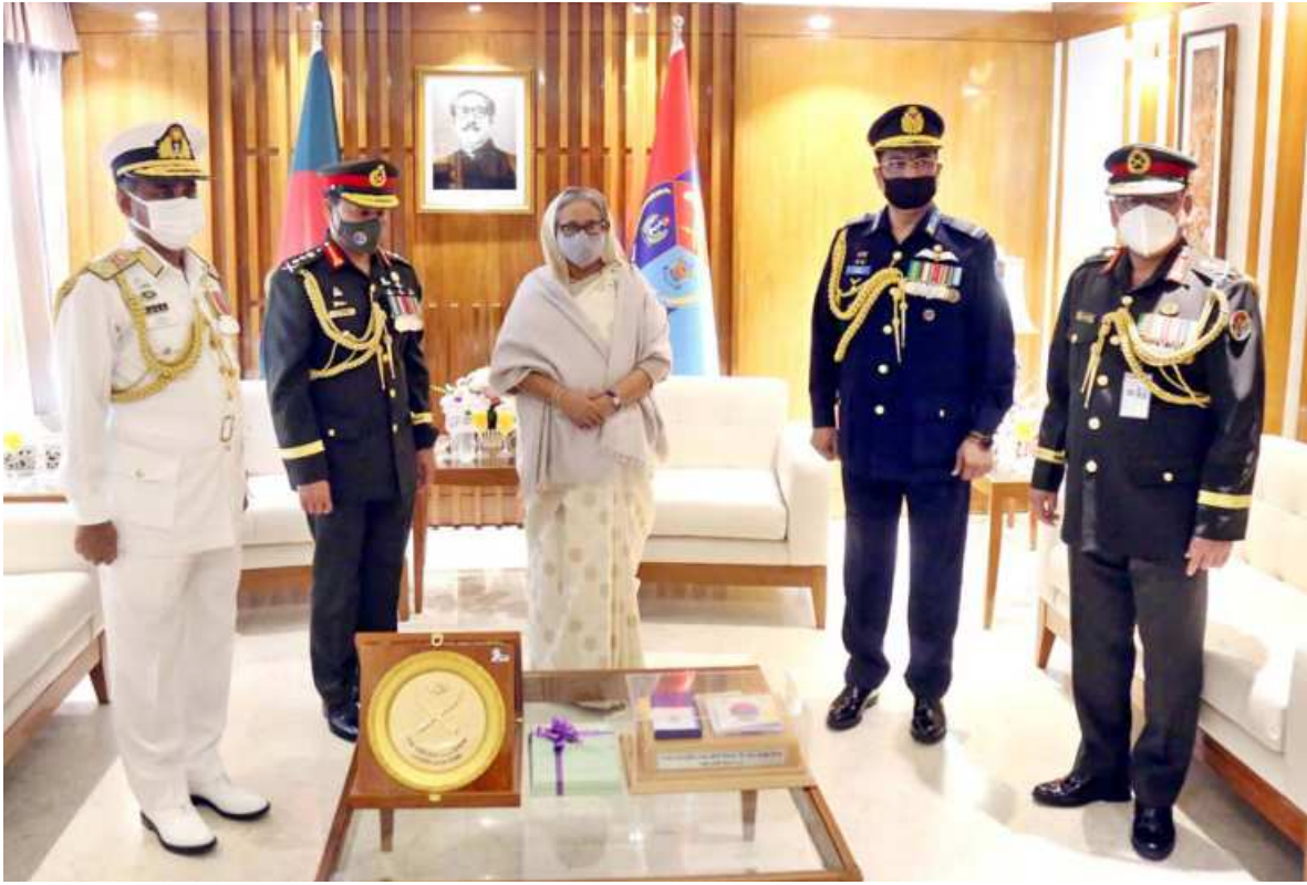
Prime Minister Sheikh Hasina with high-ranking officials of the armed forces yesterday. Hasina virtually joined a reception at the Army Multipurpose Complex at Dhaka Cantonment from the Gono Bhaban on the occasion of the Armed Forces Day-2021.

In some parts of Europe, volunteers set up registration centres to help compatriots sign up.