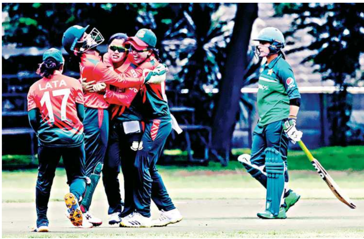
Bangladesh players celebrate the dismissal of a Pakistan batter during their Women's World Cup Qualifier match in Harare yesterday. Bangladesh restricted Pakistan to 201 for seven before chasing down the target with two balls to spare to seal a thrilling three-wicket victory.