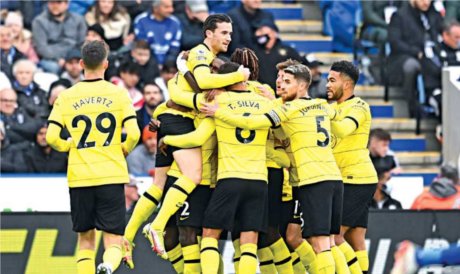
Chelsea players celebrate Antonio Rudiger's opening goal against Leicester City in their Premier League encounter at the King Power Stadium on Saturday. The Blues won the match 3-0 to go six points clear at the top of the table with 29 points from 12 matches.