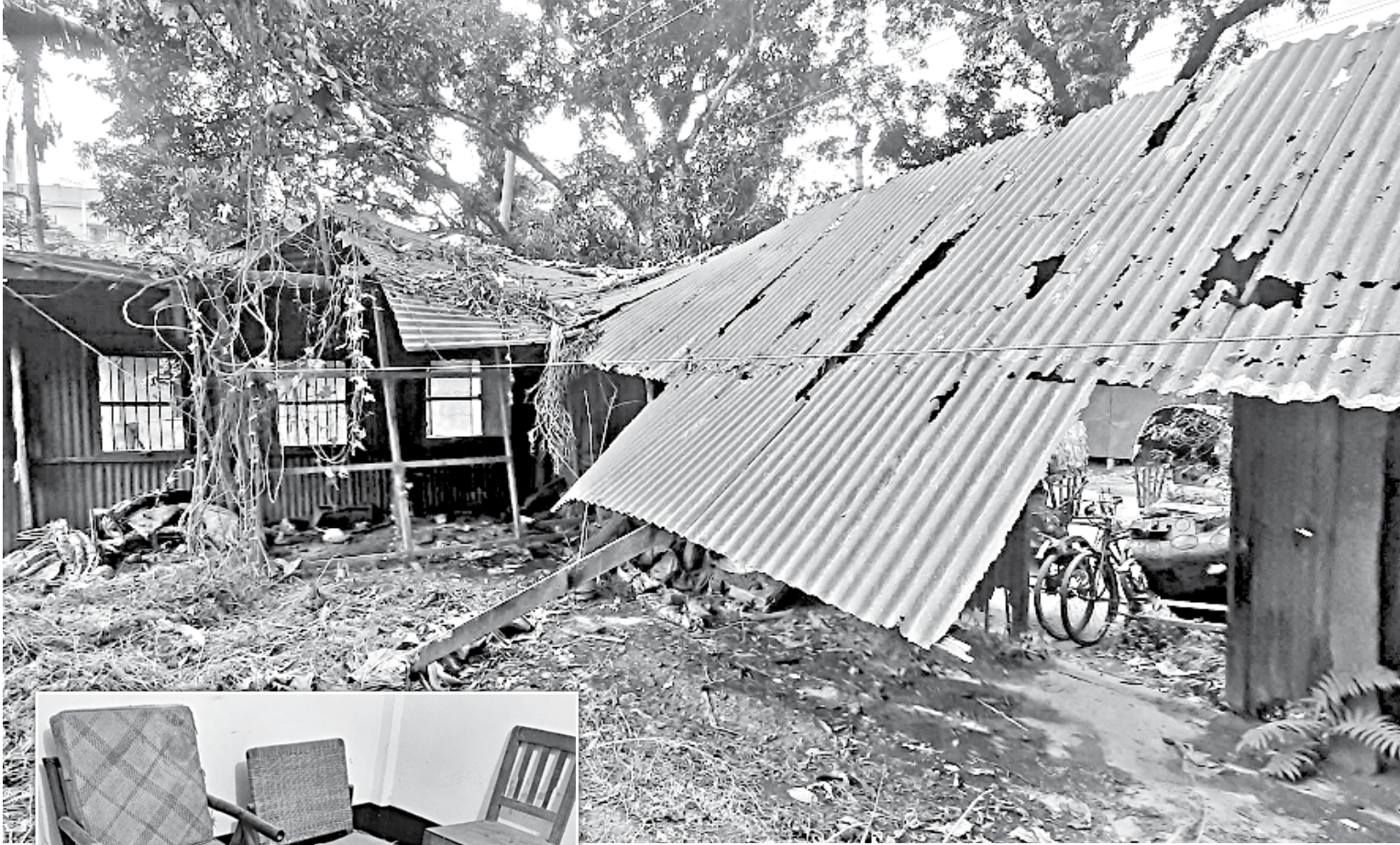
Recent photos of what's left of the Suchi Shilpo School -- established at Tangail's Santosh by Maulana Abdul Hamid Khan Bhasani -- and several furniture that are collecting dust at the Bhasani Museum, inset, also at the same location.