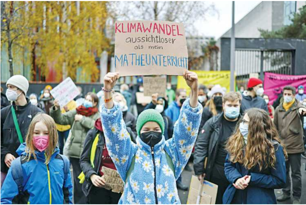
A girl holds a sign reading "Climate change more hopeless than my math class", as Global Climate Strike activists of the movement Fridays for Future protest during the coalition negotiation, in Berlin, Germany yesterday.

"Instead of them returning with improved ambitions every five years they are going to do it every year... That doesn't really mean much unless that actually leads to anything."