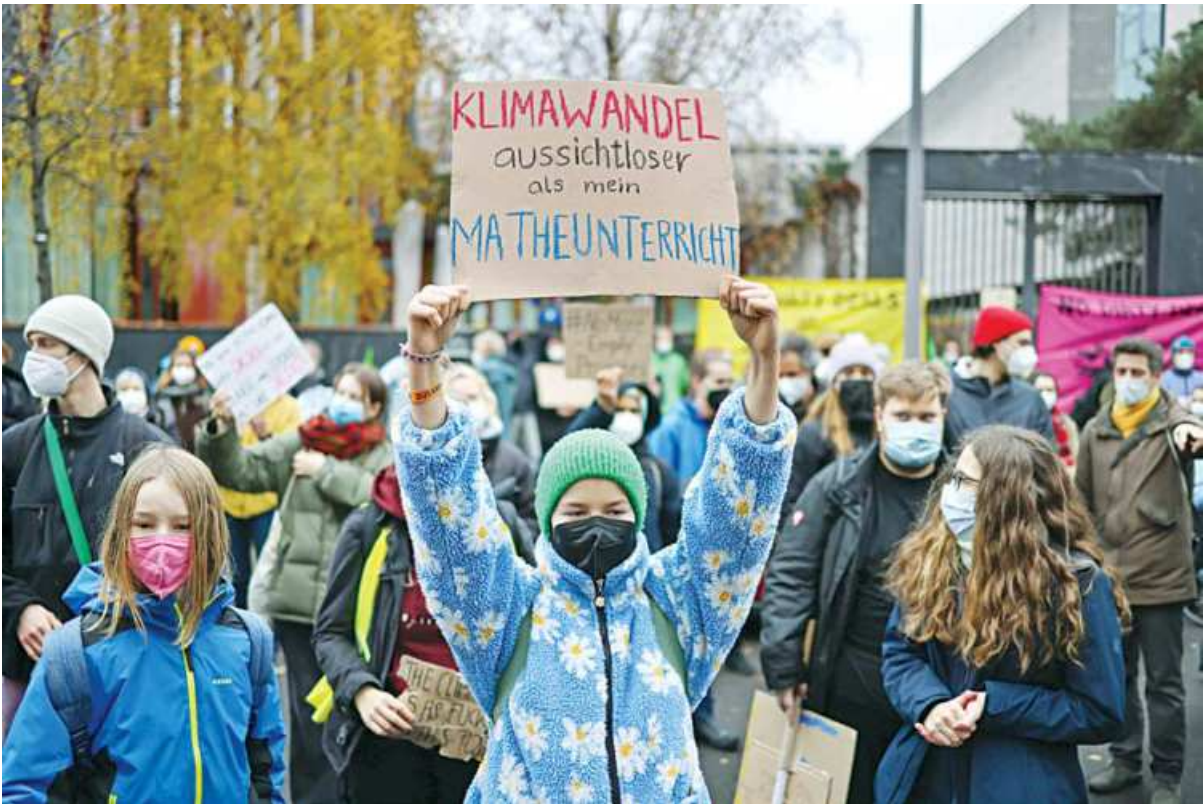
A girl holds a sign reading "Climate change more hopeless than my math class", as Global Climate Strike activists of the movement Fridays for Future protest during the coalition negotiation, in Berlin, Germany yesterday.