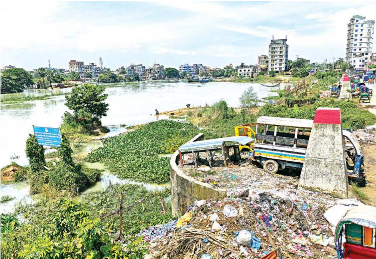
Right next to a pile of garbage and abandoned vehicles, the BIWTA authorities have put up a signboard for the proposed eco park on the Turag near the Gabtoli-Mirpur Road in the capital. The pillar with the red paint marks the edge of the river. The photo was taken recently.