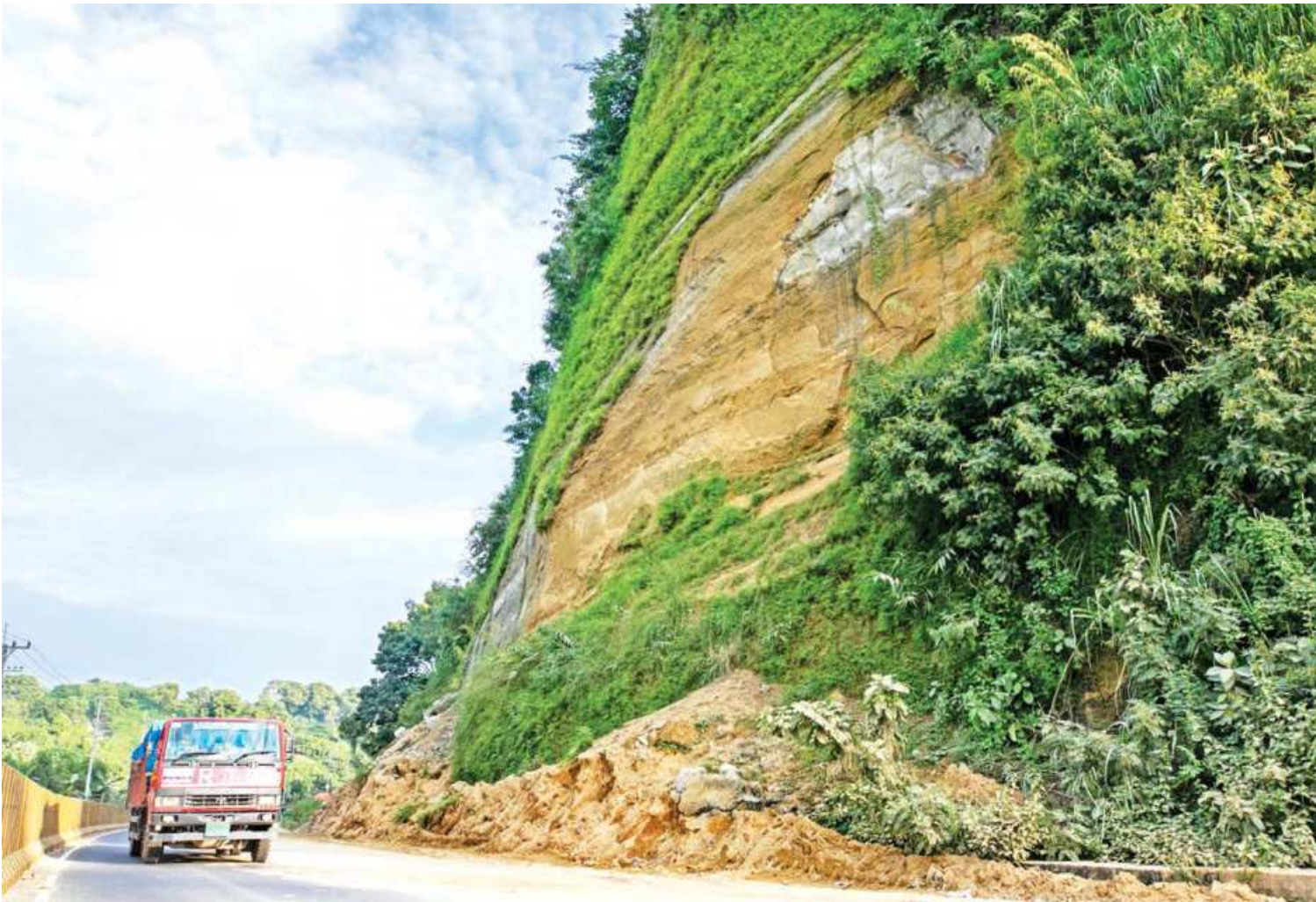
A truck plying the Bayezid Link Road in Chattogram city. This stretch of the road had lately been shut for vehicles after a landslide, but the authorities concerned have opened it up again without taking any protective measures, posing risk to commuters' lives.