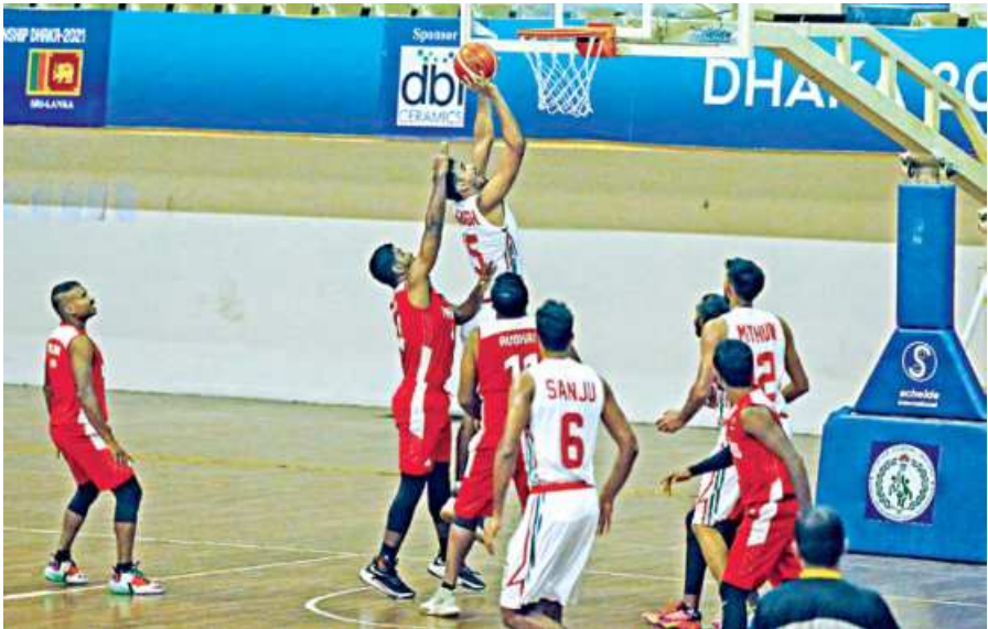
A Bangladesh player cages one during their Bangabandhu 6th South Asian Basketball Championship fixture against Maldives at the Shaheed Suhrawardi Indoor Stadium in Mirpur yesterday. Bangladesh won the match by 86-65 points.