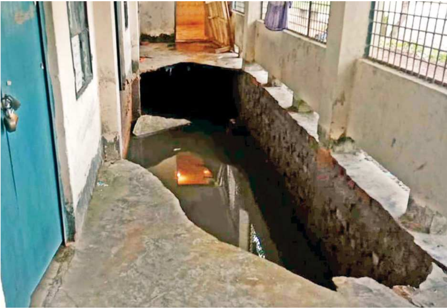
The ground floor of Patuakhali Government College dorm caved in as students gathered there following a meeting regarding their seat allocation. The photo was taken yesterday.