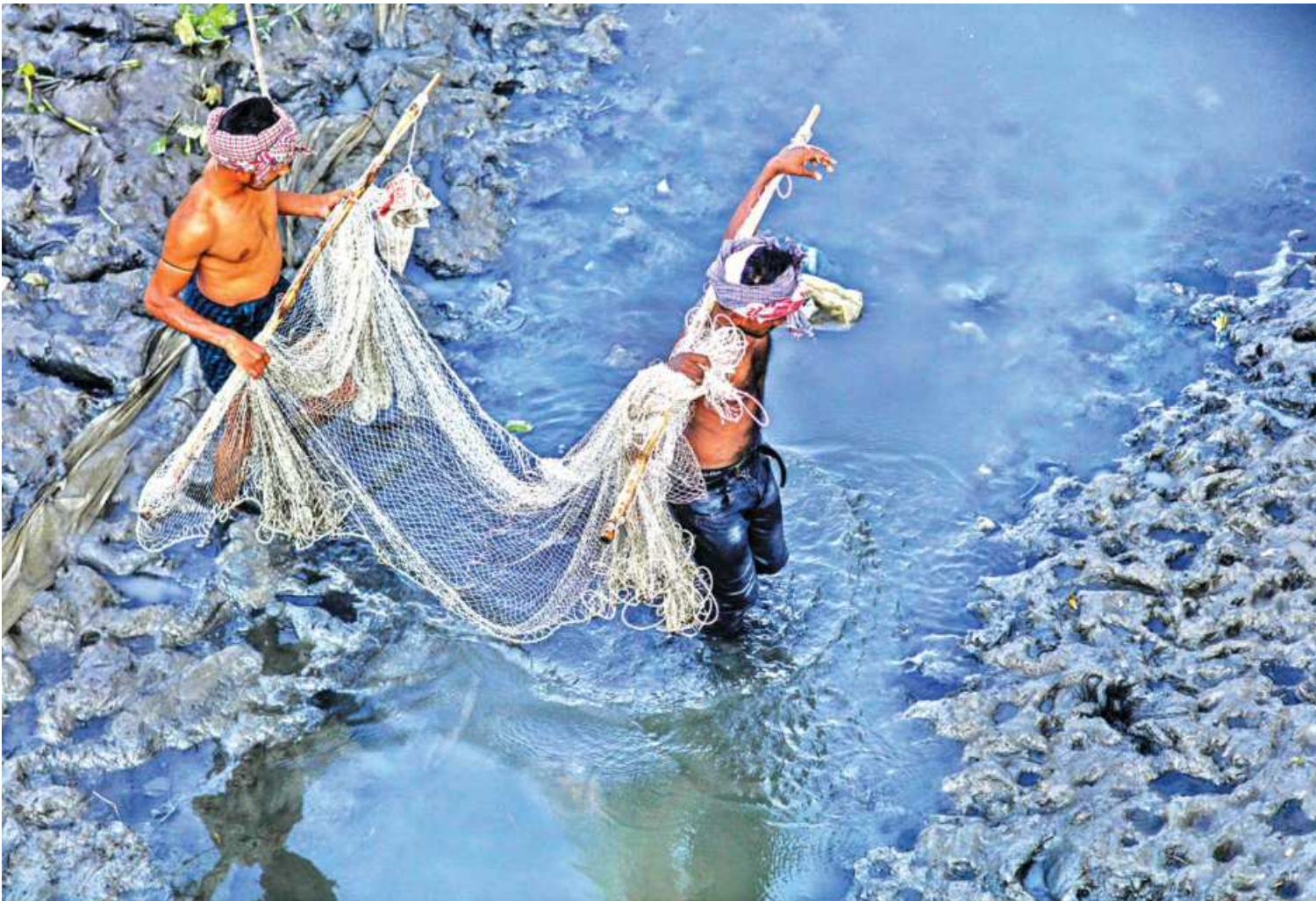
Locals go for fishing on the Turag in the capital's Basila area as the river dried up in the winter season. Many other rivers across the country are now also drying up. The photo was taken yesterday.