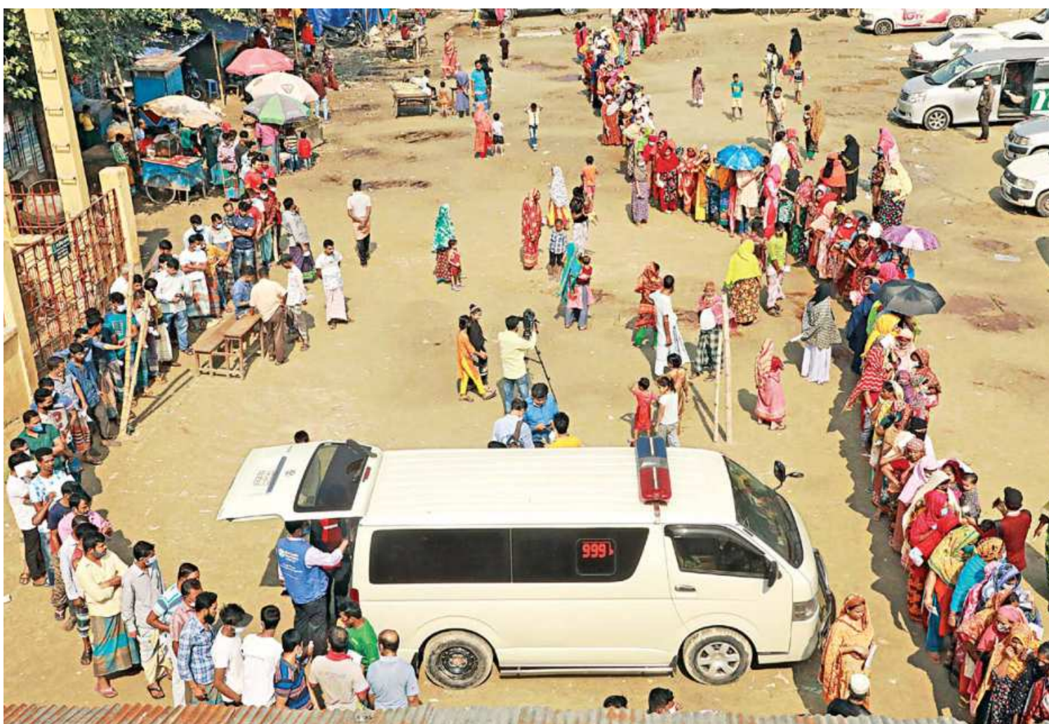
Residents of Karail slum wait in long queues at the vaccination centre at Pallibandhu Ershad Bidyalaya in the capital's Mohakhali to get inoculated against Covid-19 yesterday, the first day of a campaign to inoculate slum dwellers aged 18 and above.