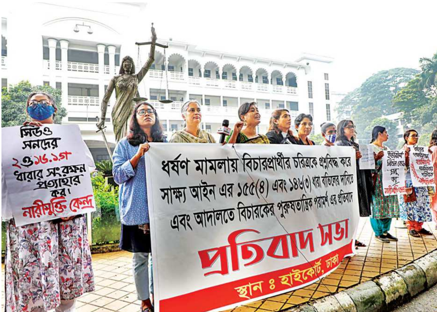
Nari Mukti Kendra, a women's rights organisation, held a protest rally in front of the Lady Justice sculpture of the High Court yesterday, demanding the quashing of sections 155(4) and 146(3) of the Evidence Act, which question the character of litigants in rape cases.