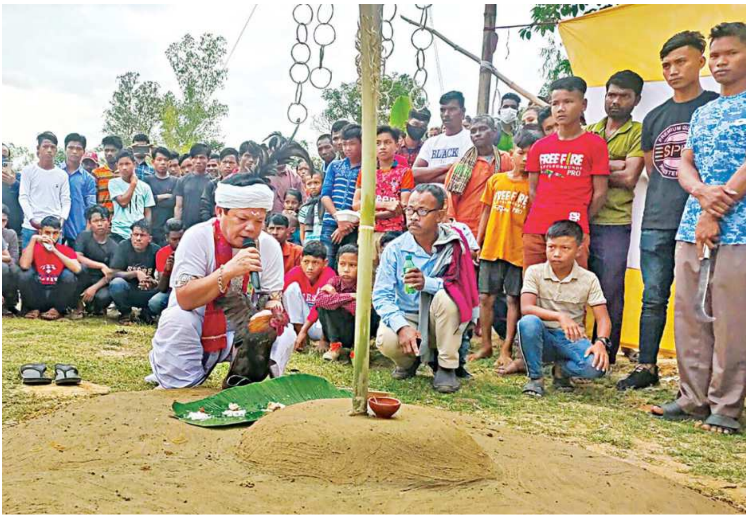
A priest, or "Khamal" of the Garo tribe, conducting the Wangala puja, a thanksgiving festival for harvest, at a temple in Sreemangal's Moulvibazar yesterday afternoon. Music, dance and spiritual offerings were performed in the puja in the presence of around 1,000 people.