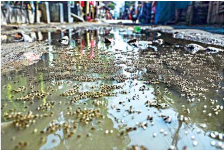
The situation is especially worse for those who live near drains or garbage dumps -- the breeding ground of the deadly insects.

The mosquito problem of Khulna city is becoming more and more menacing by the day. Right after sunset, the insects start swarming the city's ponds, bushes, water bodies, and drains. Soon enough they start thronging households too. But despite repeated complaints to the city corporation, residents are yet to find respite from this recurring issue that, in the dengue season, poses a threat to their lives. According to the Khulna City Corporation, the city has seen a yearly increase in its allocation to deal with mosquitoes, which includes buying larvicides, bleaching powder, and more. From Tk 2.1 crore in 2014-2015 fiscal year, the budget increased to Tk 3.18 crore for 2021-2022. This is doing little to contain the issue. Beyond households, the situation especially affects those who live out on the streets. Aina Bibi (72), a homeless woman living at Khulna Rail Station premises, said she doesn't remember the last time she had a good night's sleep due to constant nagging of mosquitoes. "Almost every night passes