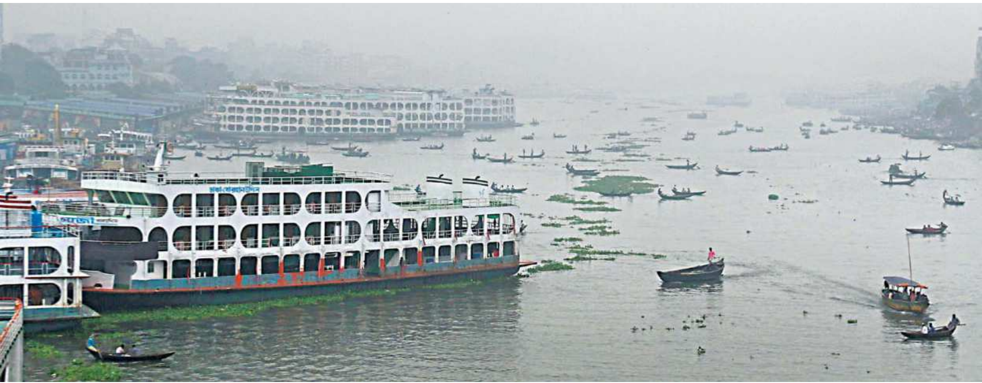
After the last couple of days' light rainfall, the mercury has dropped across the capital, hinting at the first signs of winter. At Buriganga river, fog shrouded the skyline for a large part of the morning yesterday, making life a tad bit difficult for the vehicles that ply on it.

With robbers gone, their place has been taken by a group of influential people, widely known as "Saheb". Currently, the situation at the island is so grave that no one dares to sell a single fish or fishing boat without the Sahebs' permission, alleged locals.