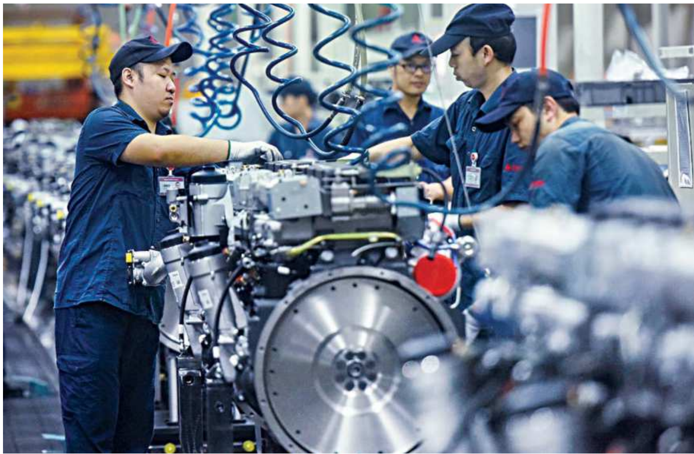
Chinese workers make heavy truck engines at a factory in Hangzhou in China's eastern Zhejiang province.

He added that this follows "a range of policy measures to boost coal production and lower coal prices". But economic momentum remained weak in October, he said, "with the real estate downturn weighing on industry and a new wave of Covid outbreaks dampening household consumption". "The slowdown in the property sector continued, which is the key risk for the macro outlook in the next few quarters," said Zhiwei Zhang