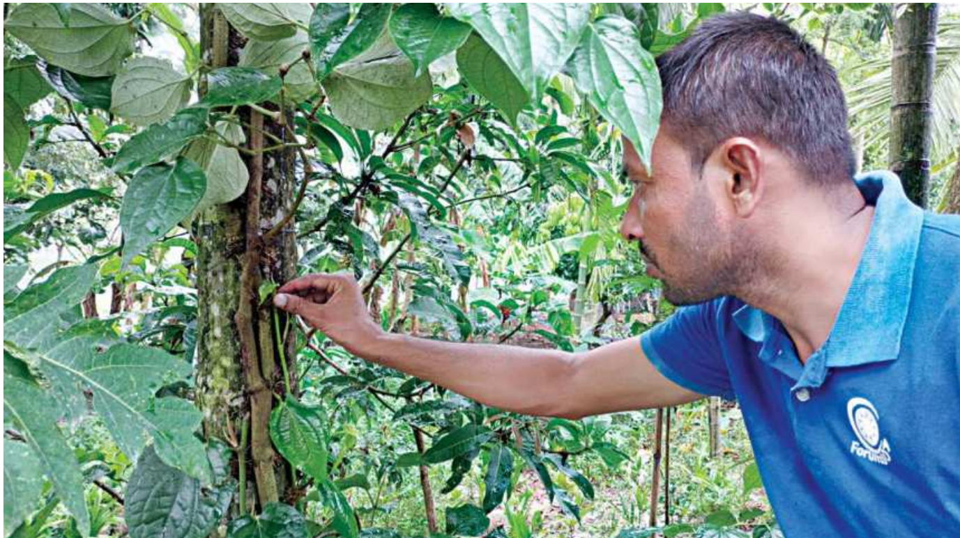
A farmer shows his piper chaba, whose vines are called chui jhal in Bangla and used to make meat dishes spicier, in Sindurna village in Lalmonirhat's Hatibandha upazila.