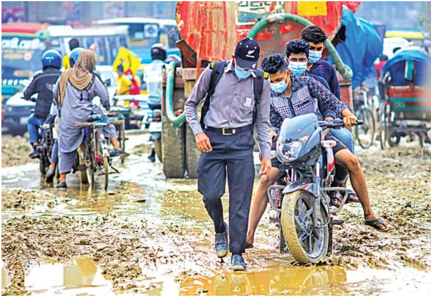
November rain leaves this road in Tongi Bridge area all muddy. Pedestrians are the ones who suffer the most as the Tongi Bridge has been deemed too dangerous for vehicles following damage.