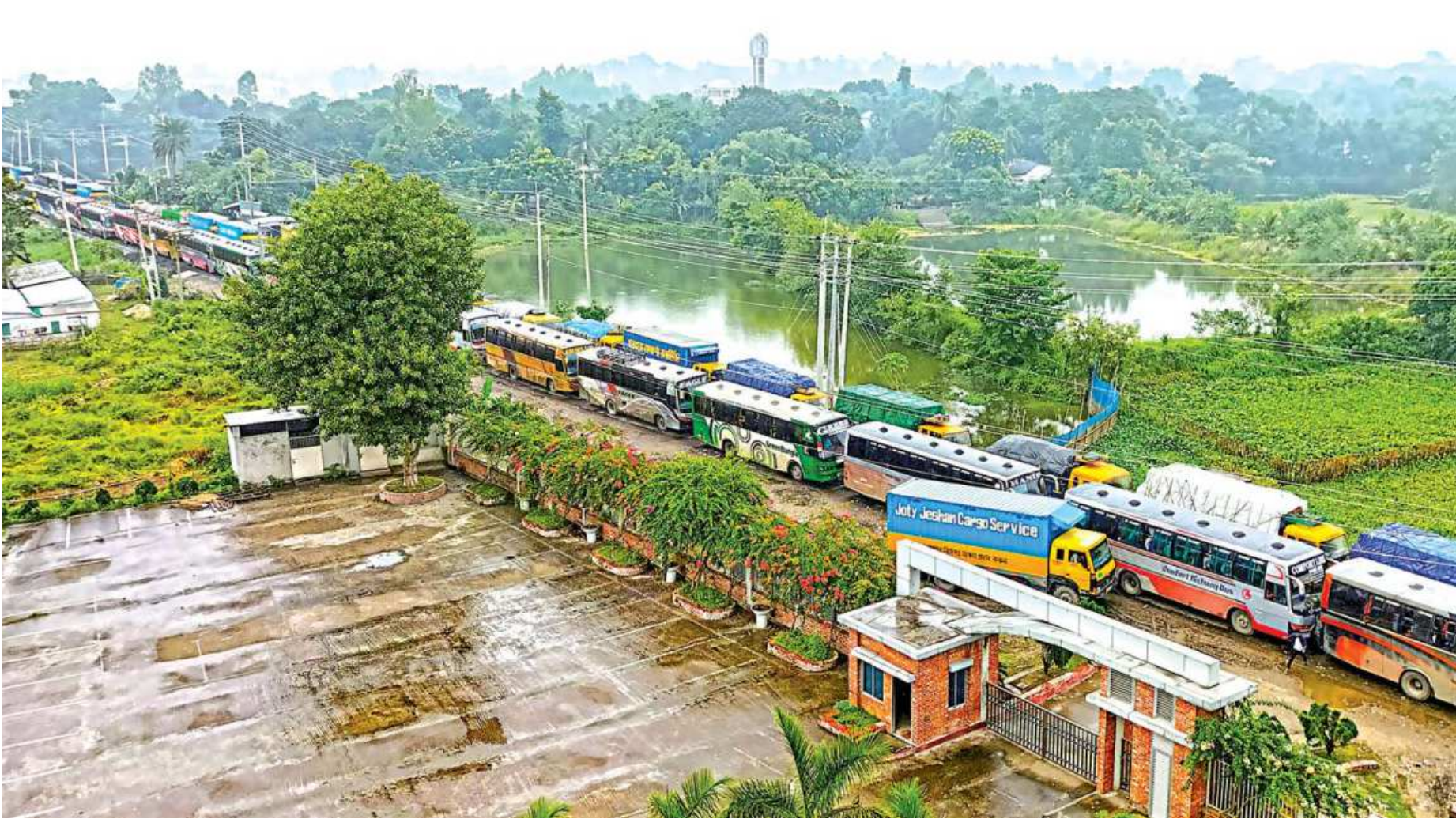
Hundreds of vehicles, many of them goods-laden ones, waiting to cross the Padma in Manikganj's Paturia ferry terminal. Ferry service on Paturia-Daulatdia route is being hampered due to shortage of ferries. The photo was taken around 1:30pm yesterday.