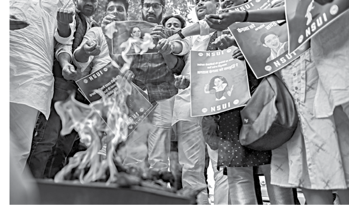
Activists of the National Students’ Union of India (NSUI) perform ‘Yagya’ a sacred Hindu fire ritual in New Delhi yesterday as a protest against Bollywood actress Kangna Ranaut’s remark on India’s Independence in the year 1947.