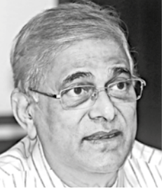
DR SHAMSUL ALAM, State Minister, Ministry of Planning, Government of People’s Republic of Bangladesh

The government alone can’t eradicate poverty. We need support from all the stakeholders. We would like to work with NGOs and civil society organisations.