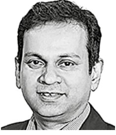
ASIF SALEH, Executive Director, BRAC

In my opinion, one of the most effective ways to tackle the threat of climate change is to address gender inequality. Women and girls in Bangladesh are proving to be phenomenally resilient by being inventive, creative, and persistent in implementing locally led adaptation. Our role should be to help these rural women step out of the sideline and to listen to their stories and ideas which we can use as inspiration for future nation builders. We must value them as productive assets for both the country and their families.