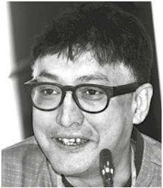
SUDIPTO MUKERJEE, Resident Representative, UNDP

In Bangladesh, the percentage of the vulnerable non-poor segment (those who are just above the poverty line) is very high at 38 percent. In China, this segment constitutes only 5 percent of the total population. It means a large number of people in our country are at risk of falling into poverty in the case of a slight deterioration in their existing conditions. This is a major vulnerability of our poverty reduction process. We are yet to find a solution to this huge problem. We need a special social protection programme for this segment of the population.