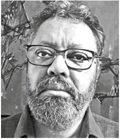
DR BINAYAK SEN, Director General, Bangladesh Institute of Development Studies

With regard to the priorities in the present context, the adoption of a gendered approach to our poverty reduction efforts is something we should seriously consider. We also need to invest to strengthen resilience of the poor. New sets of social protection measures need to be introduced to target the urban poor, climate-induced poor and those poor people who are floating around the upper and lower poverty line. We also need to emphasise strong partnership and better collaboration among all the stakeholders. Finally, we need to ensure that all our priorities related to poverty reduction are approached using an empirical and data-driven method.