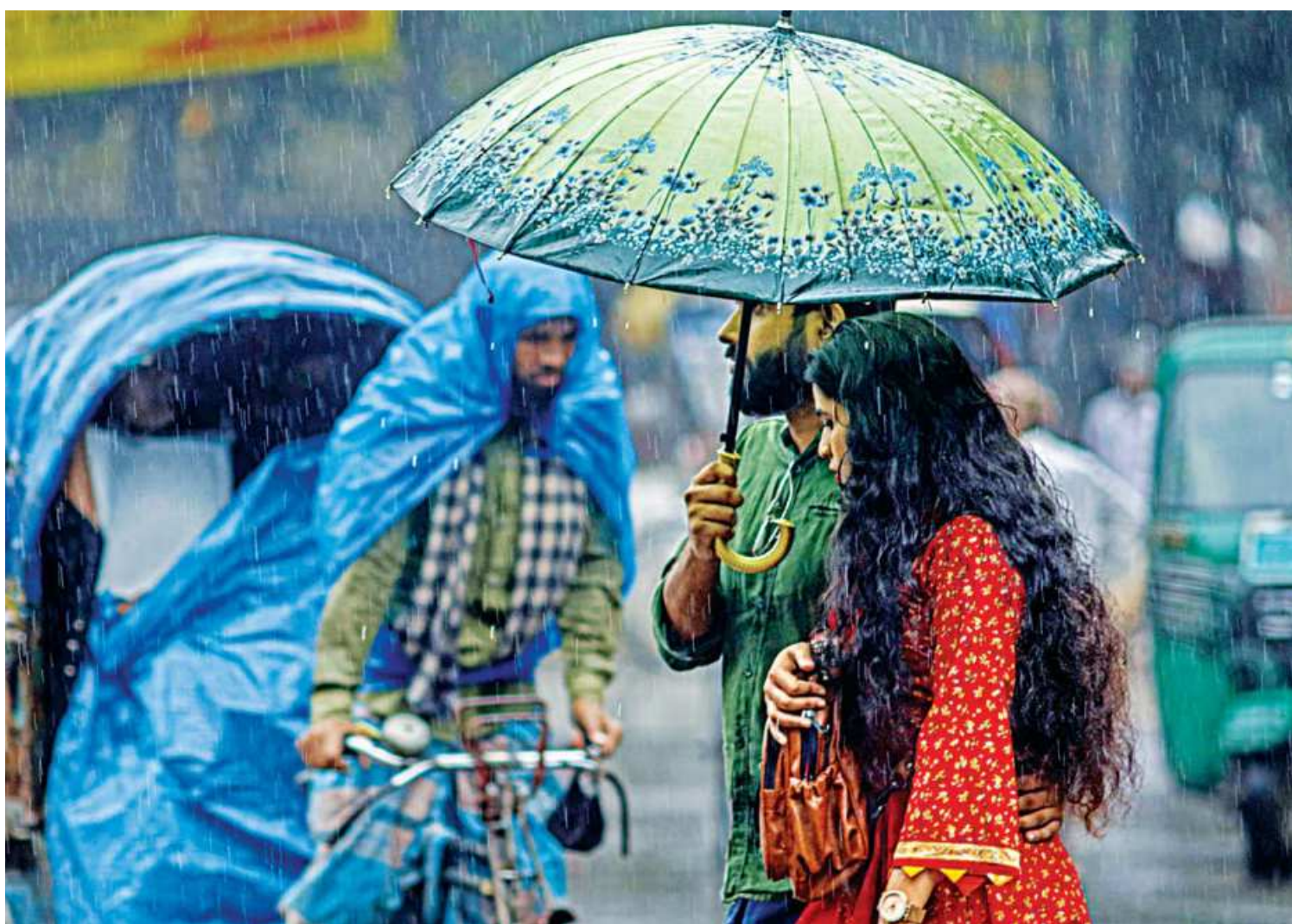
The day-long drizzling yesterday caused the temperature to drop in the capital. The photo of the young couple crossing a road in the afternoon was taken at the TSC of Dhaka University.