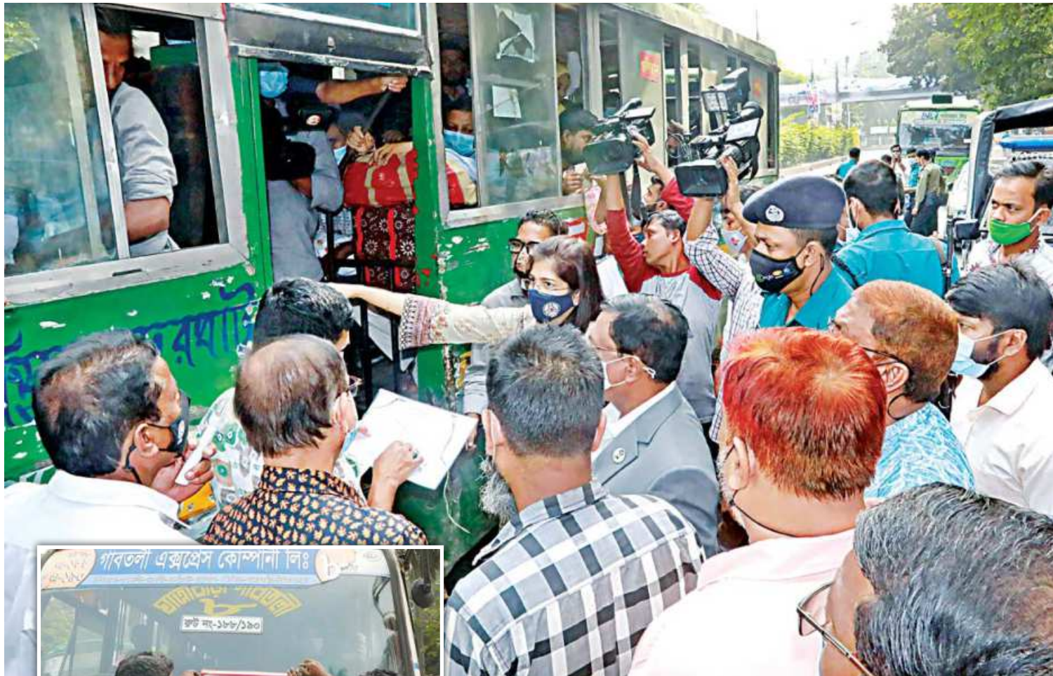
Passengers complaining to a BRTA mobile court about being charged extra in the capital's Ramna yesterday. Inset, a sticker that says the bus runs on CNG being stuck on the windscreen as the fare of CNG-run vehicles has not increased. Meanwhile, mobile courts fined 336 buses and minibuses in Dhaka and Chattogram cities for overcharging passengers.