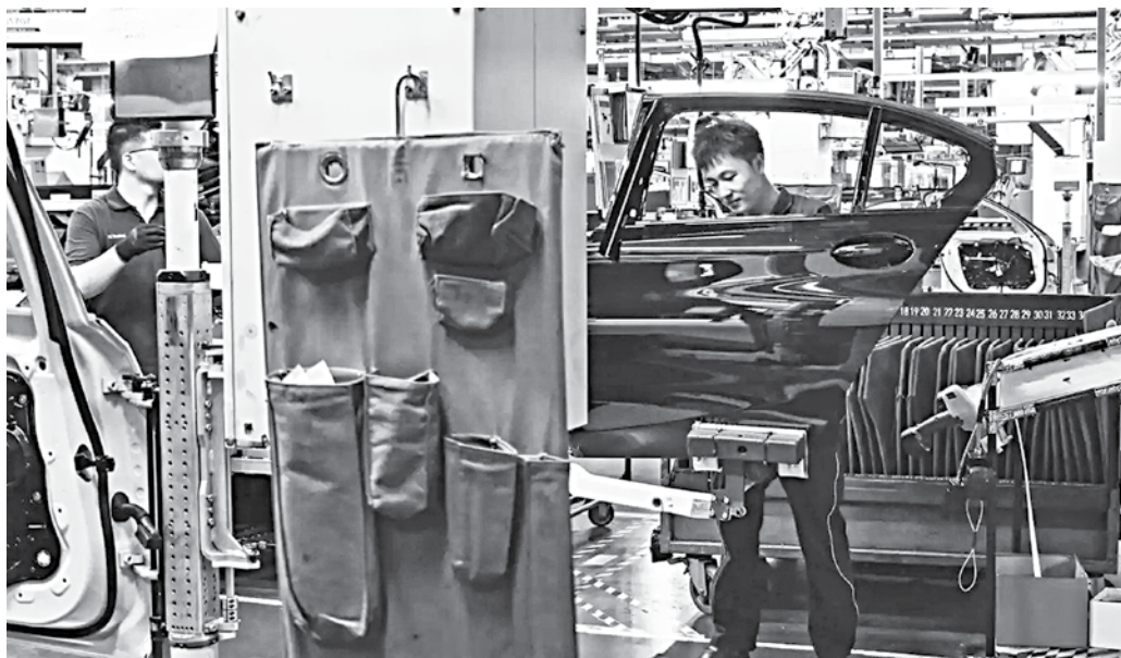
Employees work on the assembly line of X1 compact sport-utility vehicles at the Tiexi Plant of BMW Brilliance Automotive in Shenyang, Liaoning province, China on October 23.

The commerce ministry notice also told authorities to take measures to facilitate agricultural production, keep supply chains smooth, and maintain stable prices.