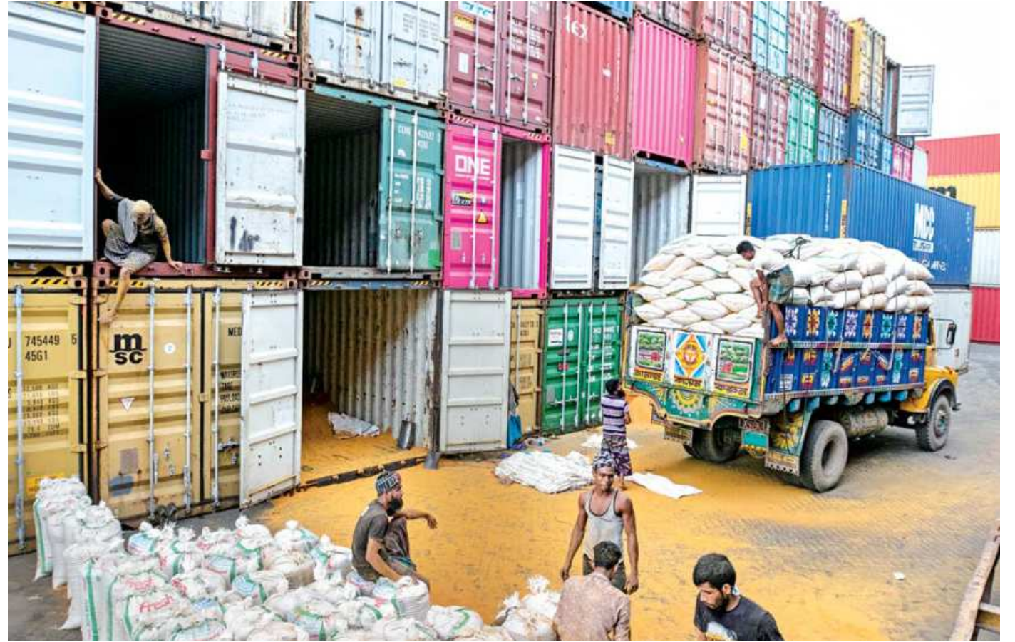
Goods are being unloaded from an inland container depot in Chattogram. The change in handling costs of import and export containers comes following a 23 per cent increase in the prices of diesel.

Had it been last year, importers would have had to bear an additional Tk 55 crore