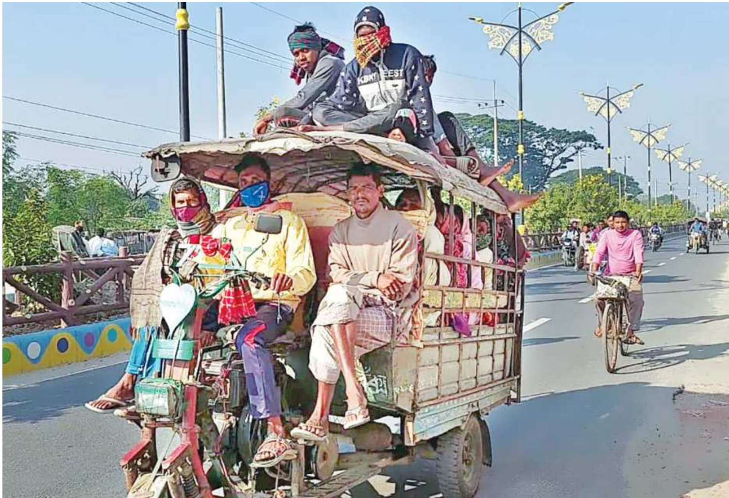
Due to the hike in public transport fares, day labourers resort to commute on top of unauthorised three-wheelers, risking their lives to go back home from work. The photo was taken yesterday on the Chapainawaganj-Dhaka highway in Rajshahi.