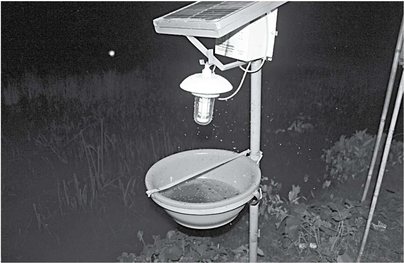
A solar-powered insect trap is seen at an Aman paddy field in Patuakhali's Dumki upazila.