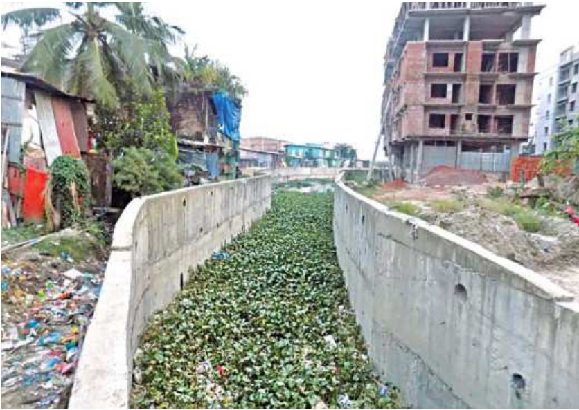
Once a kilometre-long boat route emerging at the Karnaphuli, the Manaharkhali canal is little more than a narrow drain now.