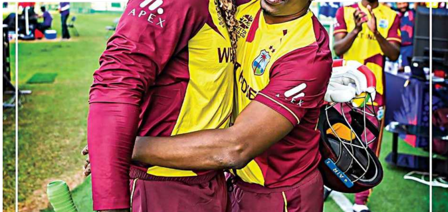
Chris Gayle and Dwayne Bravo wear broad smiles during their T20 World Cup fixture against Australia at the Sheikh Zayed Cricket Stadium in Abu Dhabi yesterday. Even though West Indies lost the game badly to end the tournament on a low, it was a memorable occasion for the two stalwarts of the game. Although the self-styled Universe Boss Gayle did not announce his retirement unlike Bravo, it is believed both superstars have played their last international games.