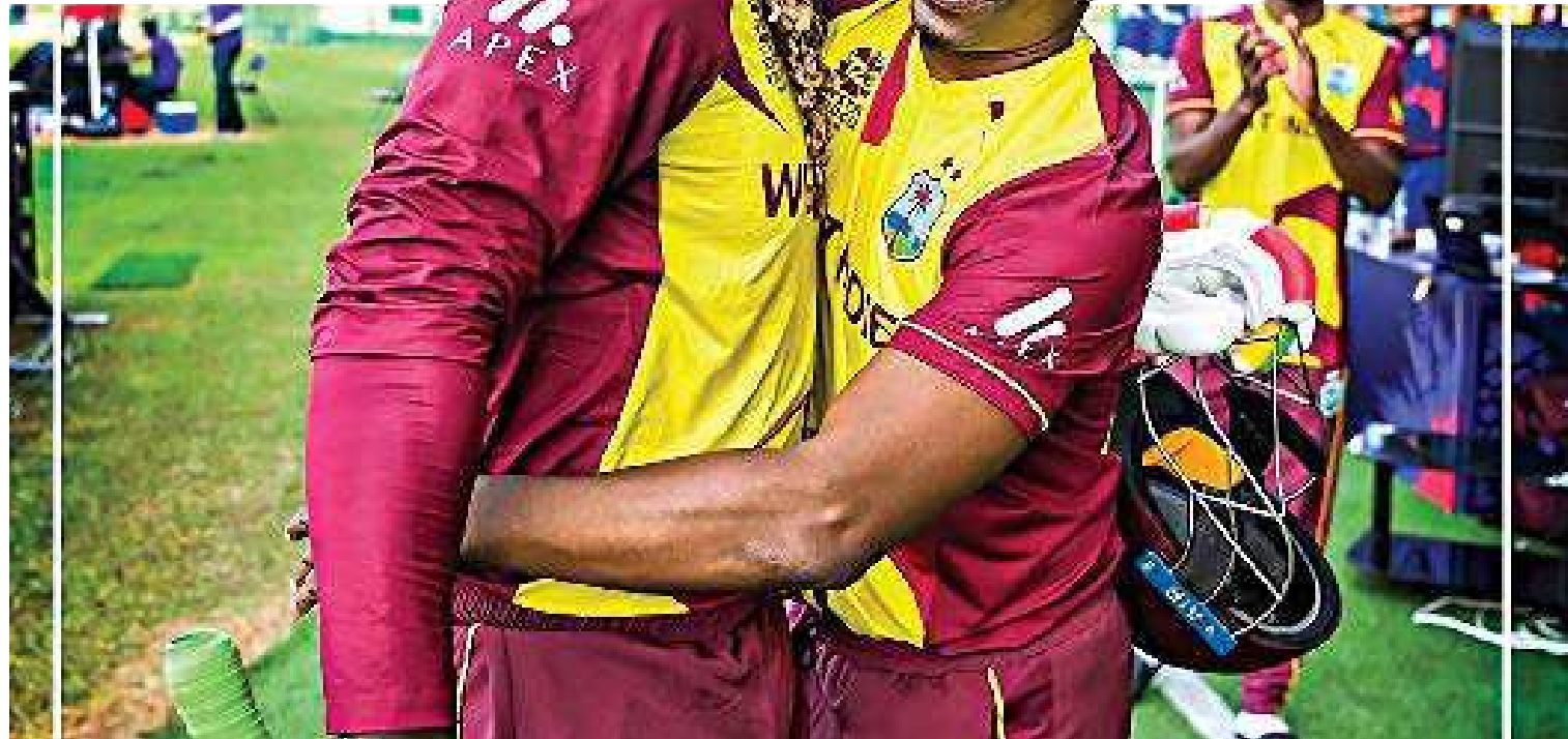
Chris Gayle and Dwayne Bravo wear broad smiles during their T20 World Cup fixture against Australia at the Sheikh Zayed Cricket Stadium in Abu Dhabi yesterday. Even though West Indies lost the game badly to end the tournament on a low, it was a memorable occasion for the two stalwarts of the game. Although the self-styled Universe Boss Gayle did not announce his retirement unlike Bravo, it is believed both superstars have played their last international games.